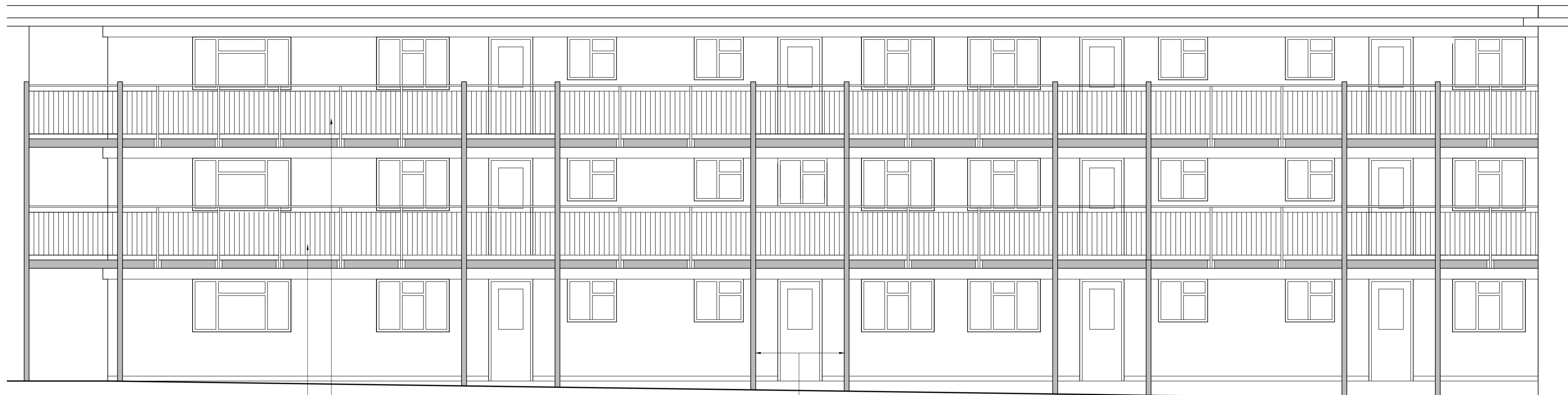
NORTH ELEVATION - PROPOSED