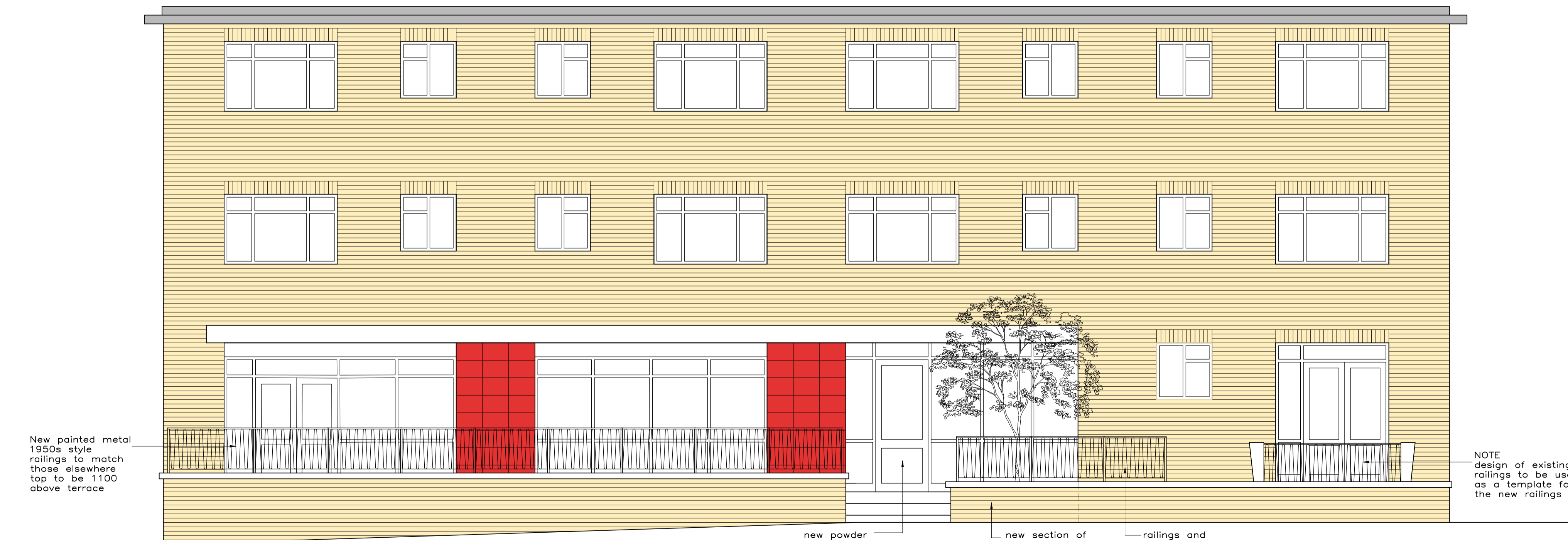
ELEVATION TO OSENEY CRESCENT [SOUTH]