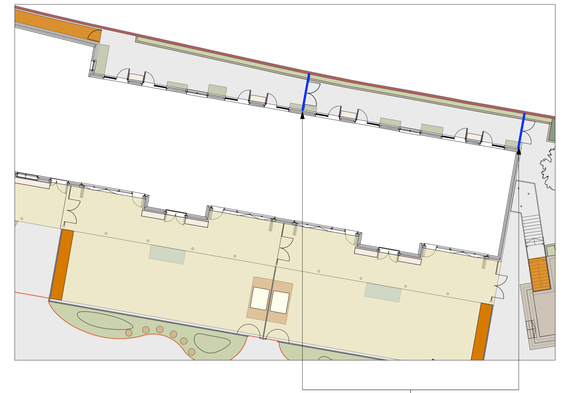
2 no. double gates in northern strip reception

Timber sleeper edge to planter - 150 x 250mm pressure treated softwood sleepers - Bolted through with 16mm stainless steel dowells - Timber to be treated with 2x coats RIW, where in contact with soil