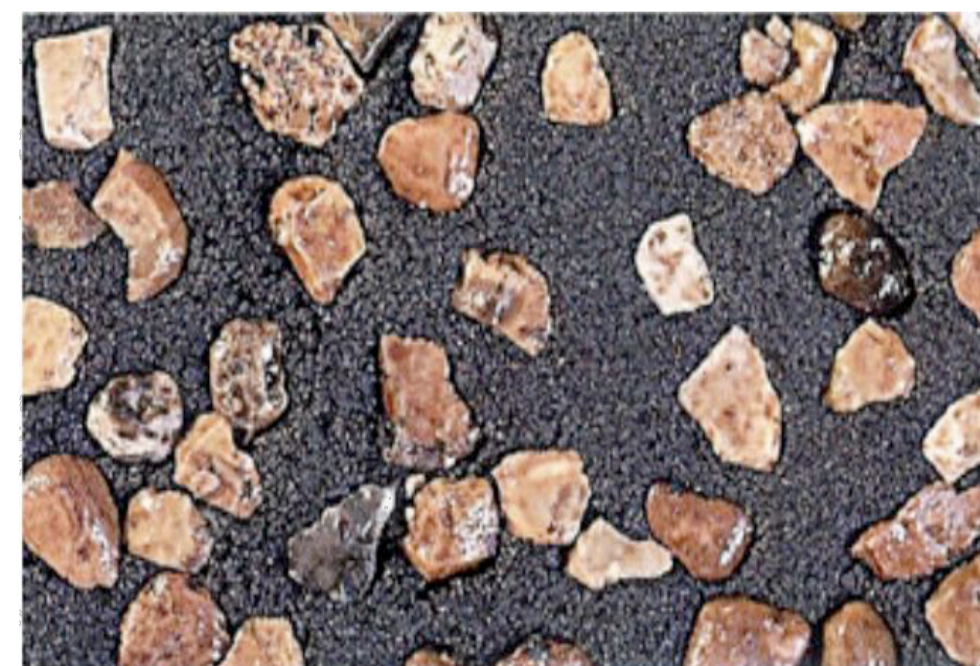
Tarmac Access Road _Pedestrian

COLOURCHIP COATED CHIPPINGS: to be spread evenly over surface and rolled into hot asphalt at time of laying.