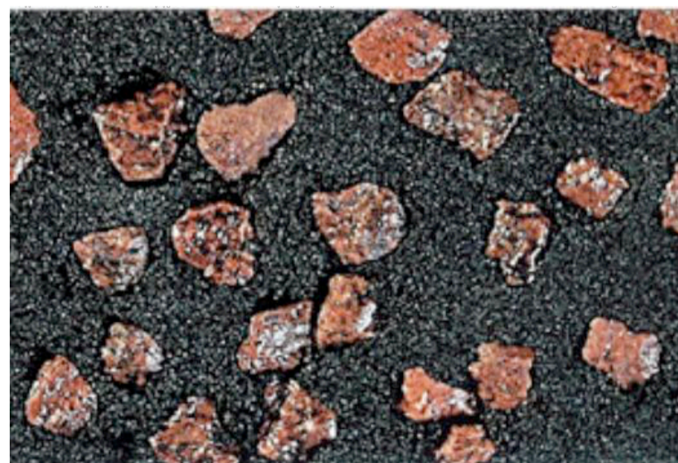
Tarmac Access Road _Vehicular