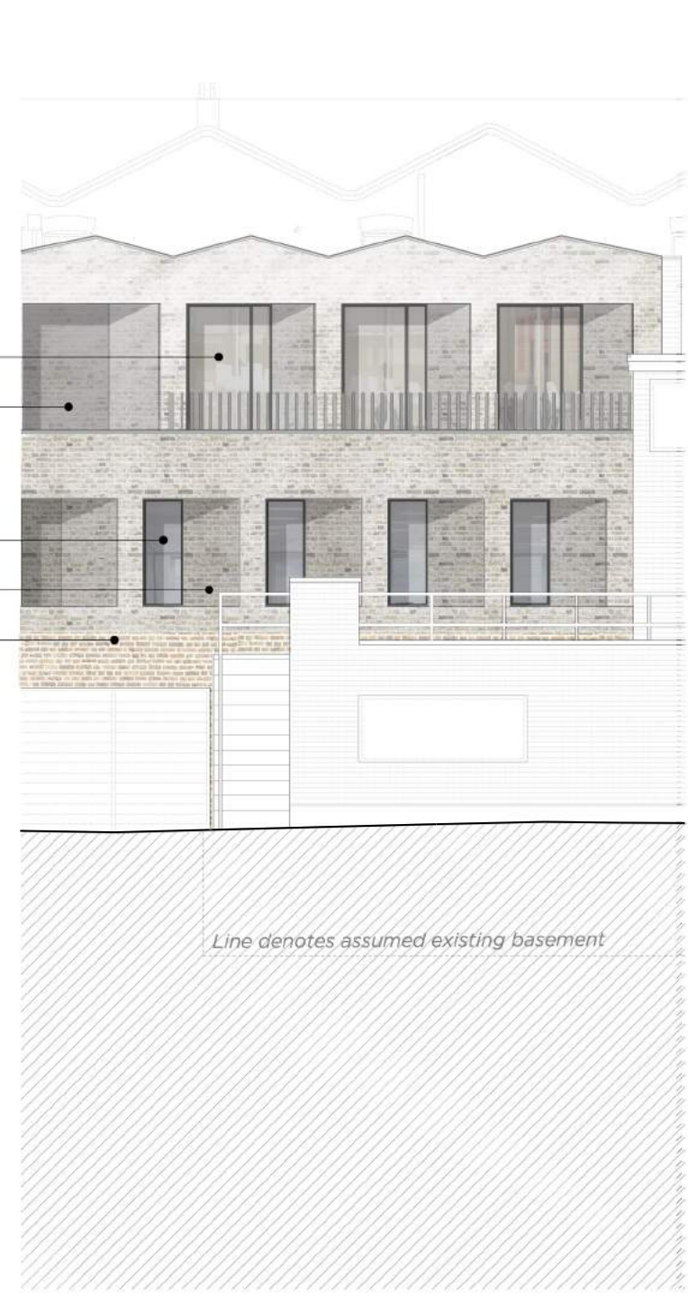
P_40 04 South West Elevation 1:50