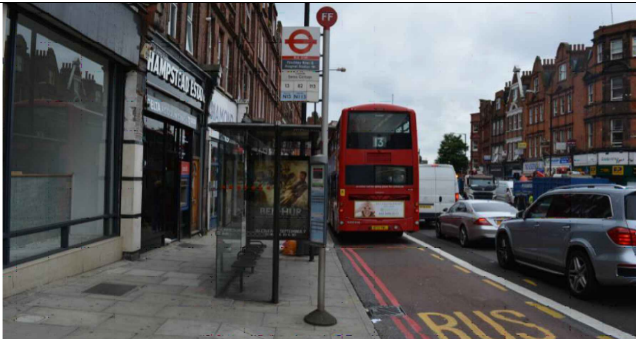
Figure 2 – facing south-east towards Swiss Cottage