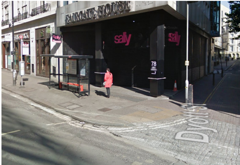
Figure 3 – refused scheme outside no. 78 (junction of New Oxford Street and Dyott Street) - 2015/5216/A

useable footpath and forcing pedestrians to walk around the advert. On that basis the sign was considered to be an inappropriate addition. In this case, the existing bus shelter is appropriately located, there is an existing panel, a single digital panel is proposed and controls to limit the display have been accepted by the applicant.