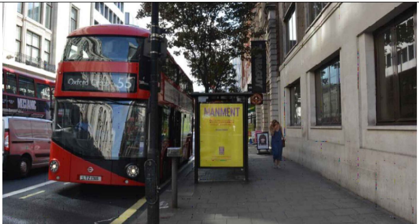
Figure 2 – facing east towards High Holborn