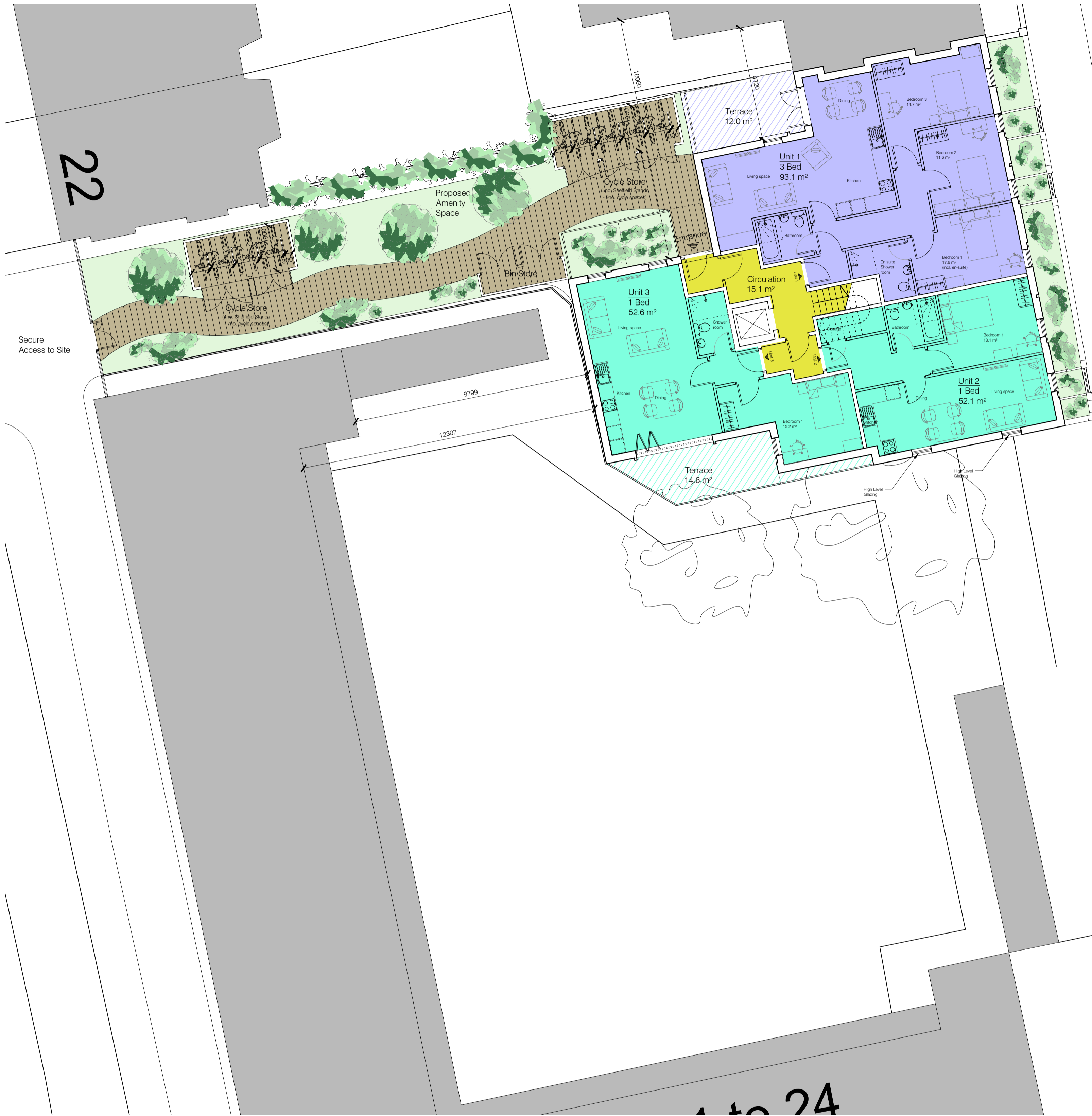
Site Plan / Ground Floor Scale 1:100