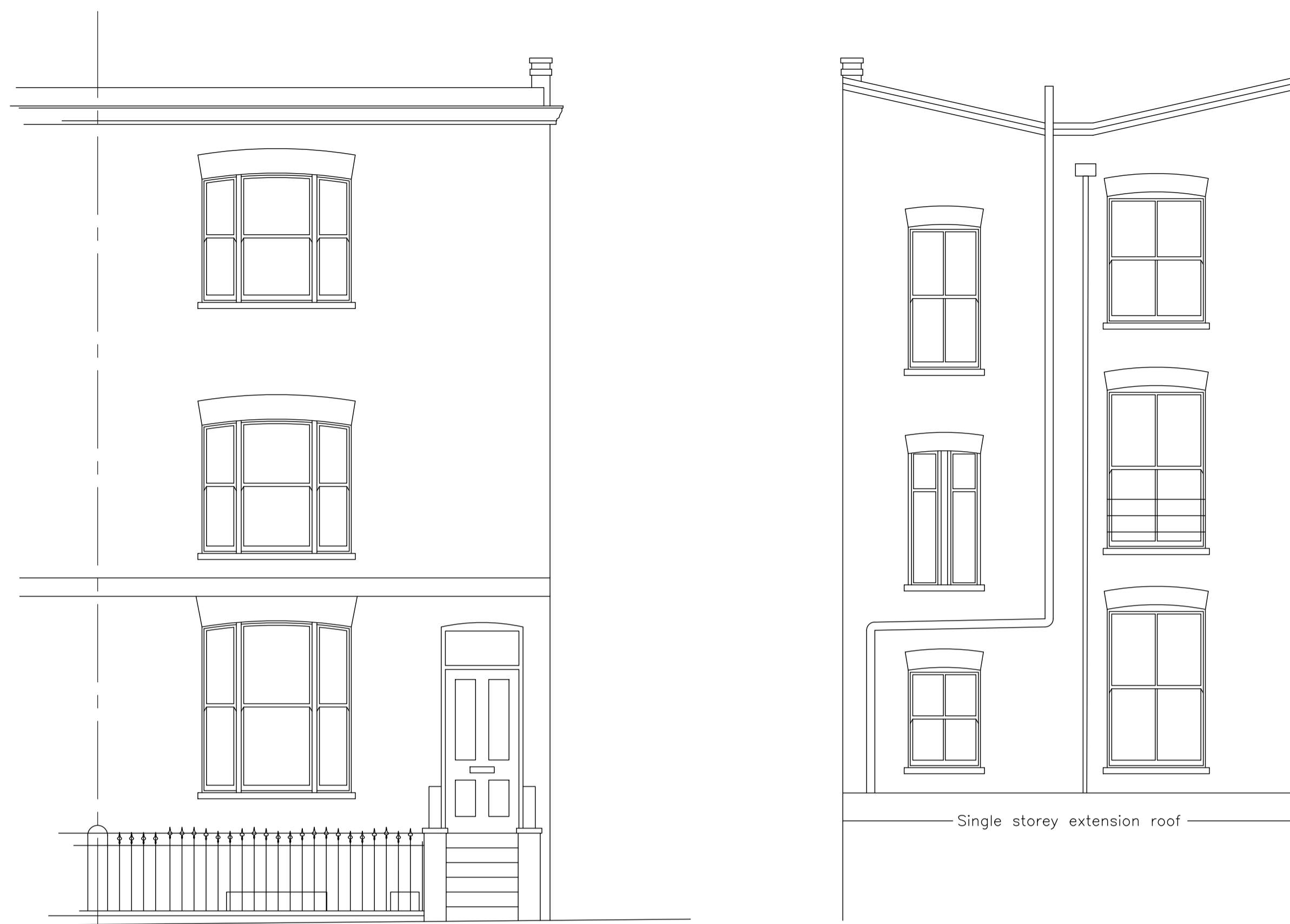
FRONT ELEVATION (1:50)