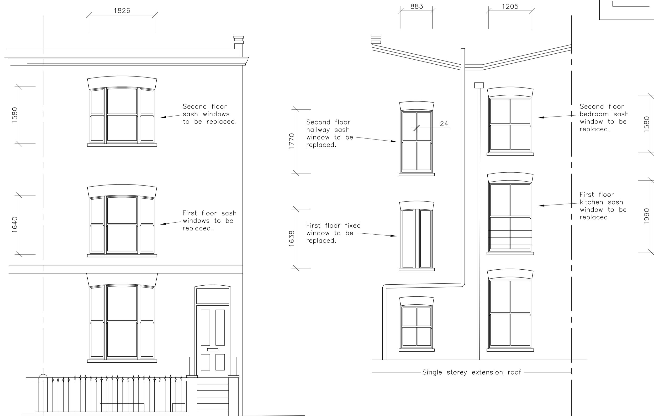
FRONT ELEVATION (1:50)