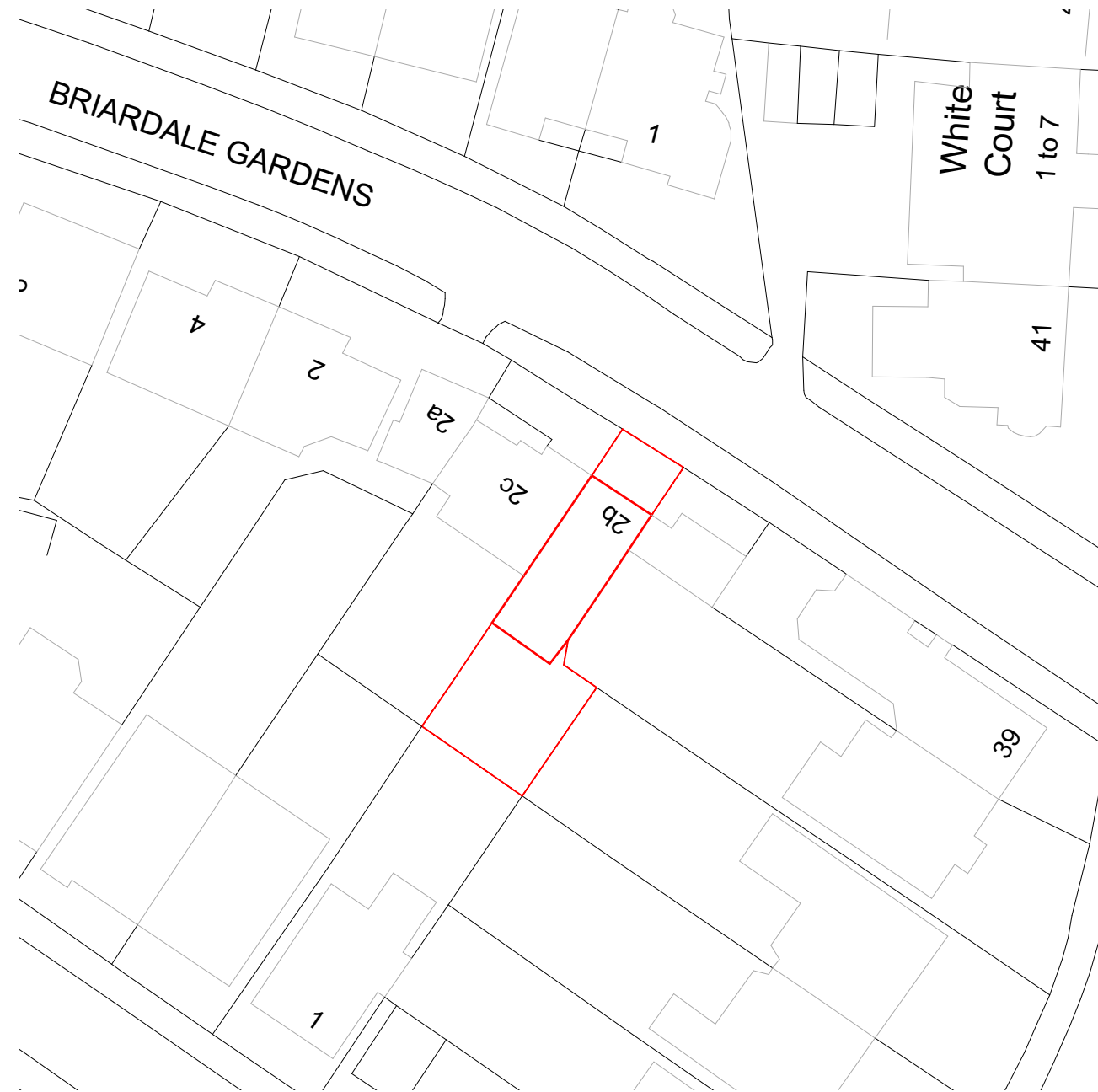
1 Site Plan 1:500@A3

ALL SETTING OUT MUST BE CHECKED ON SITE ALL LEVELS MUST BE CHECKED ON SITE ALL DIMENSIONS MUST BE CHECKED ON SITE DO NOT SCALE FROM THIS DRAWING THIS DRAWING MUST NOT BE USED ON SITE UNLESS ISSUED FOR CONSTRUCTION