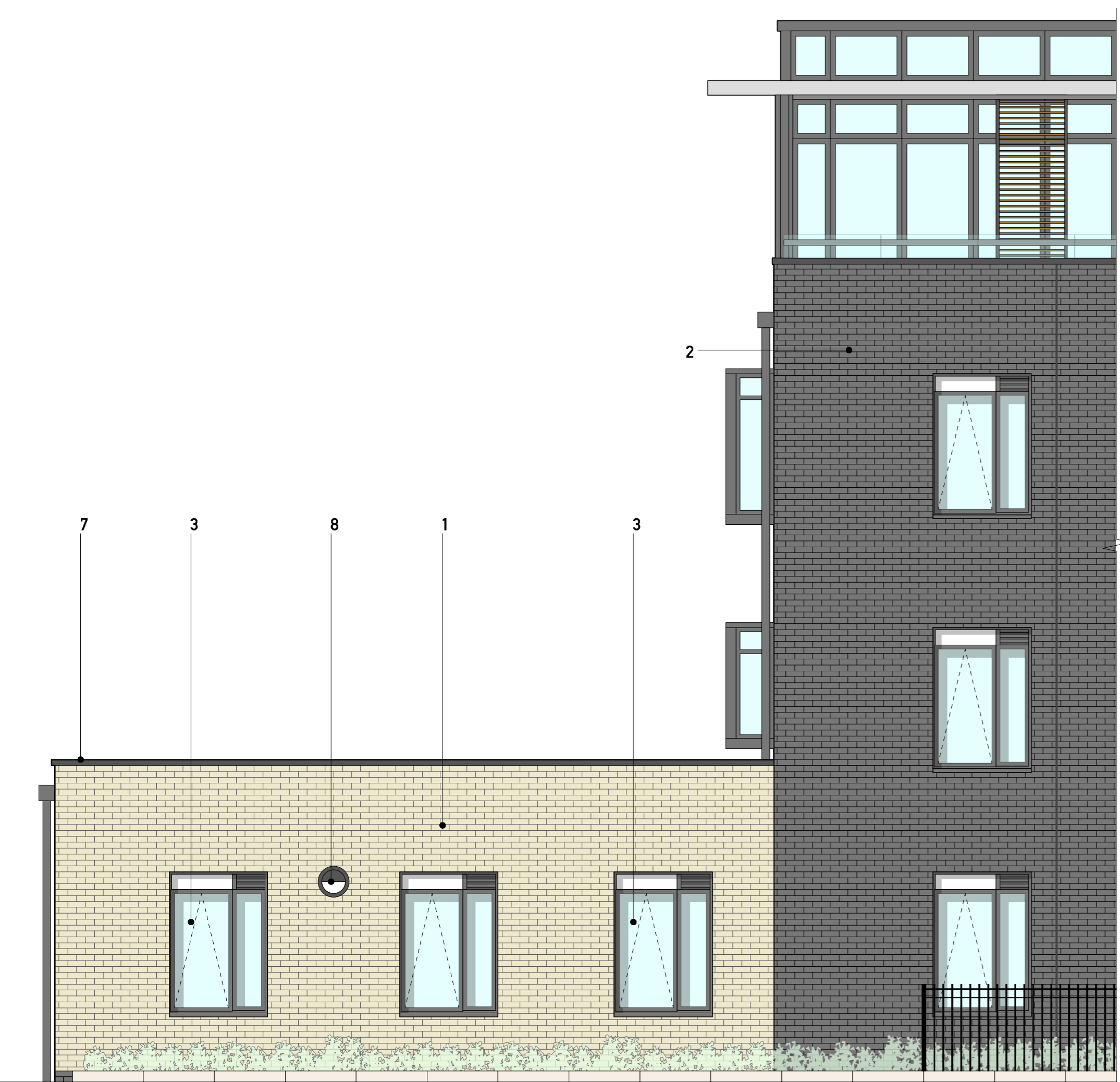
EXISTING FRONT / NORTH EAST ELEVATION