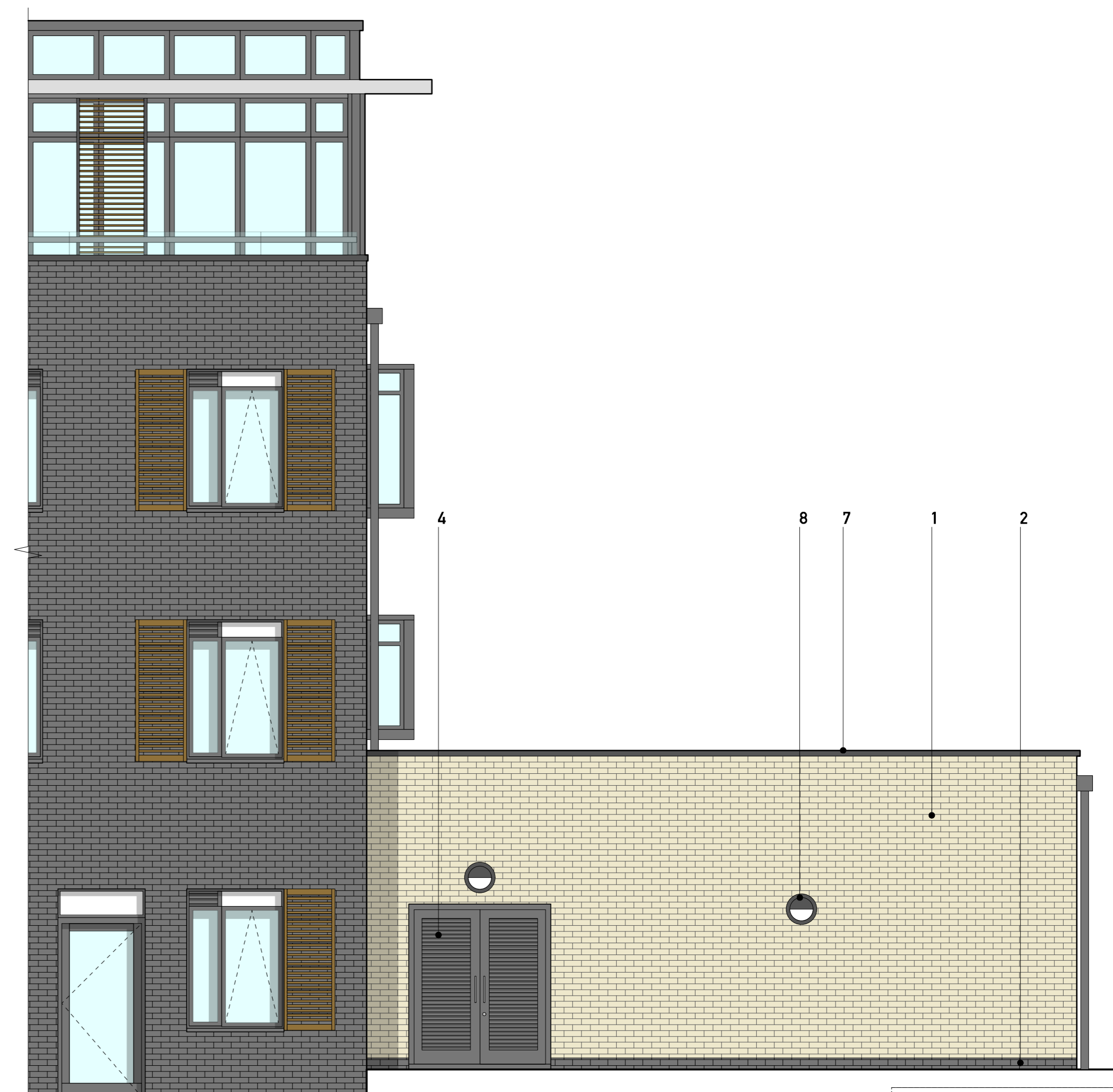
EXISTING REAR / SOUTH WEST ELEVATION