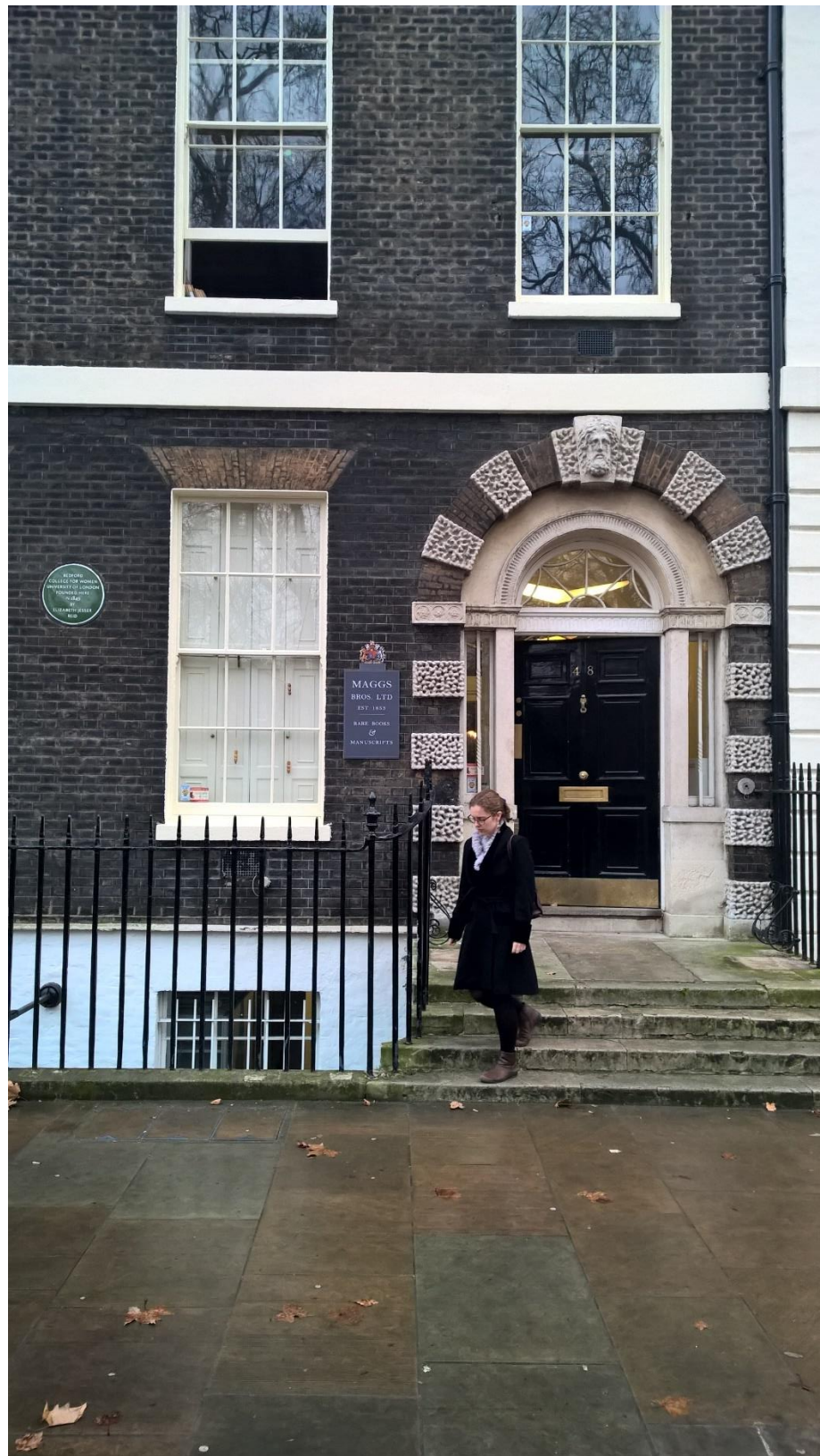
Mock-up of proposed slate plaque