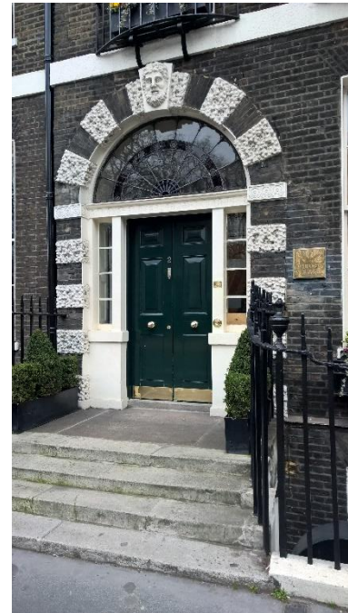
No.2 - Plaque on brickwork