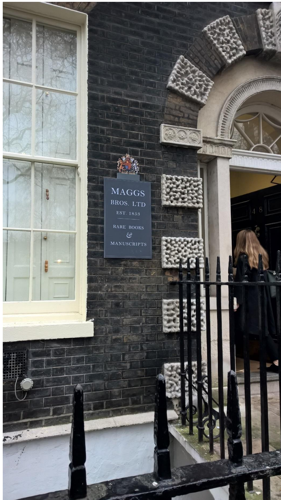
Mock-up of proposed slate plaque