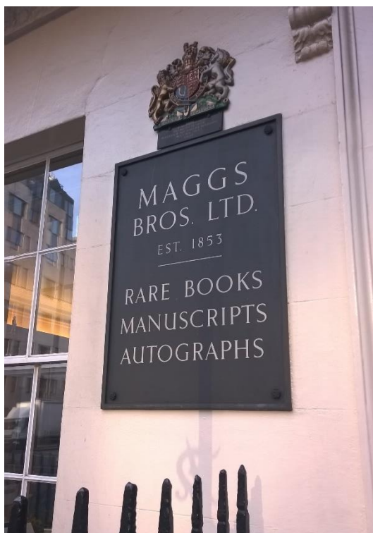
Plaque at 50 Berkeley Square

A similar plaque was attached to their grade II listed former premises at 50 Berkeley Square, as shown here: