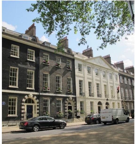
Maggs Bros. 48 Bedford Square, London WC1 Proposed plaque Design & access statement