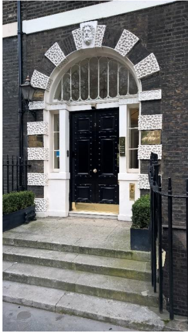
No.3 plaques both sides