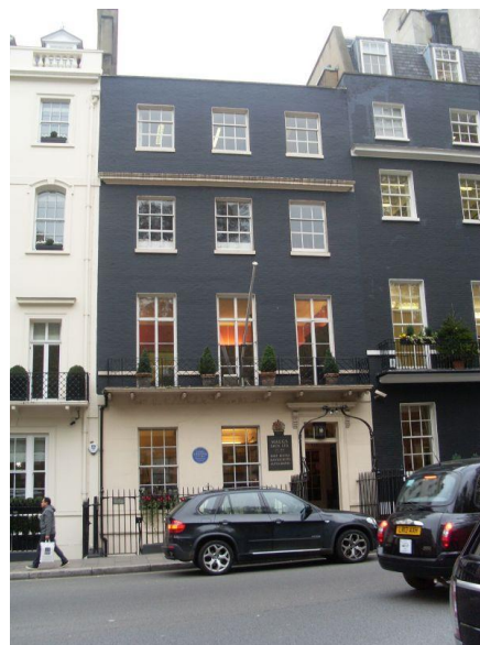
50 Berkeley Square

The plaque at 50 Berkeley Square was mounted between the ground floor window and the entrance on the ground floor. Coincidentally, there is a roundel to George Canning at 50 Berkeley Square, as there is to Bedford College at 48 Bedford Square.