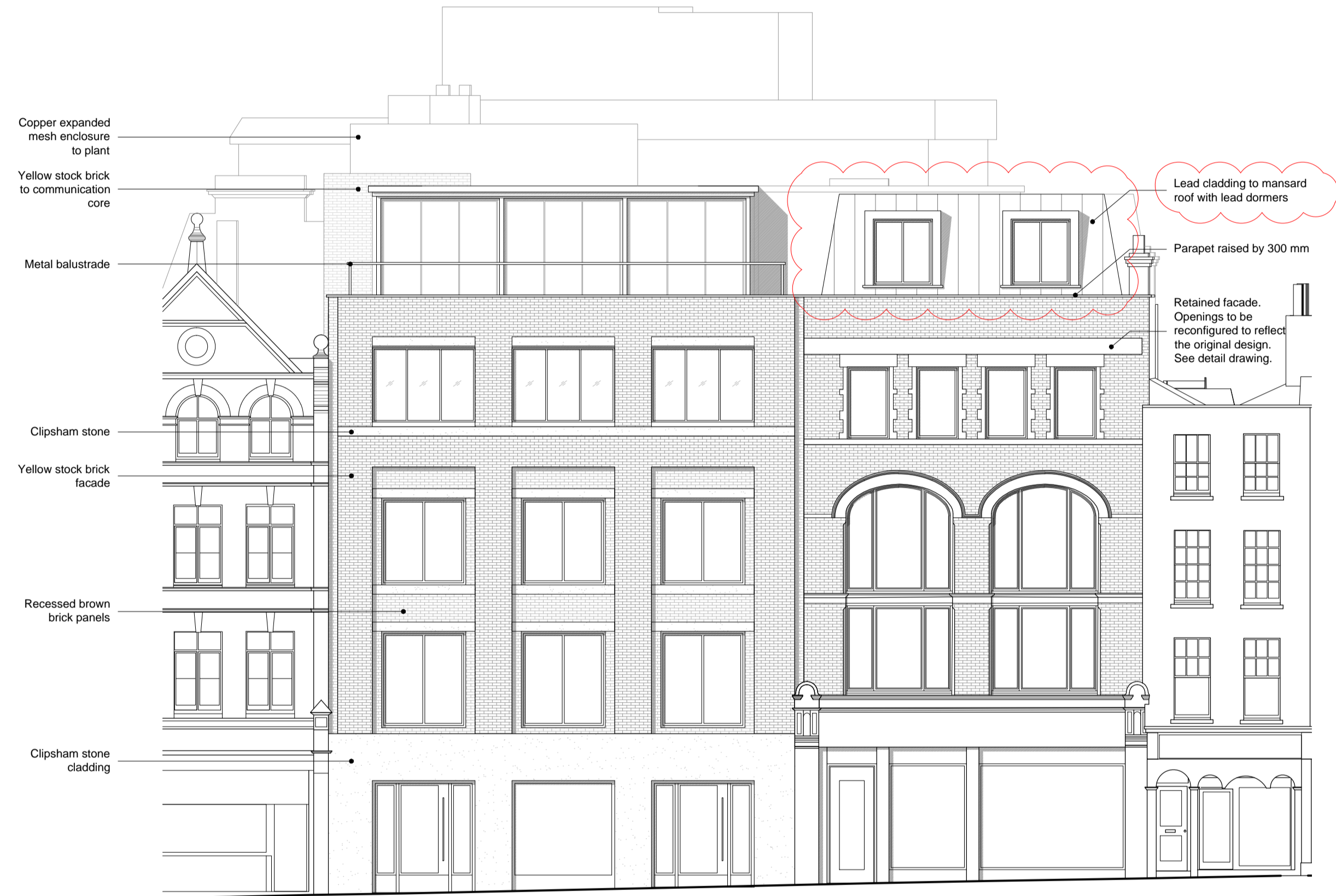
Elevation 1 - Greville Street

Demolition: Items to be demolished shown dashed & in red.