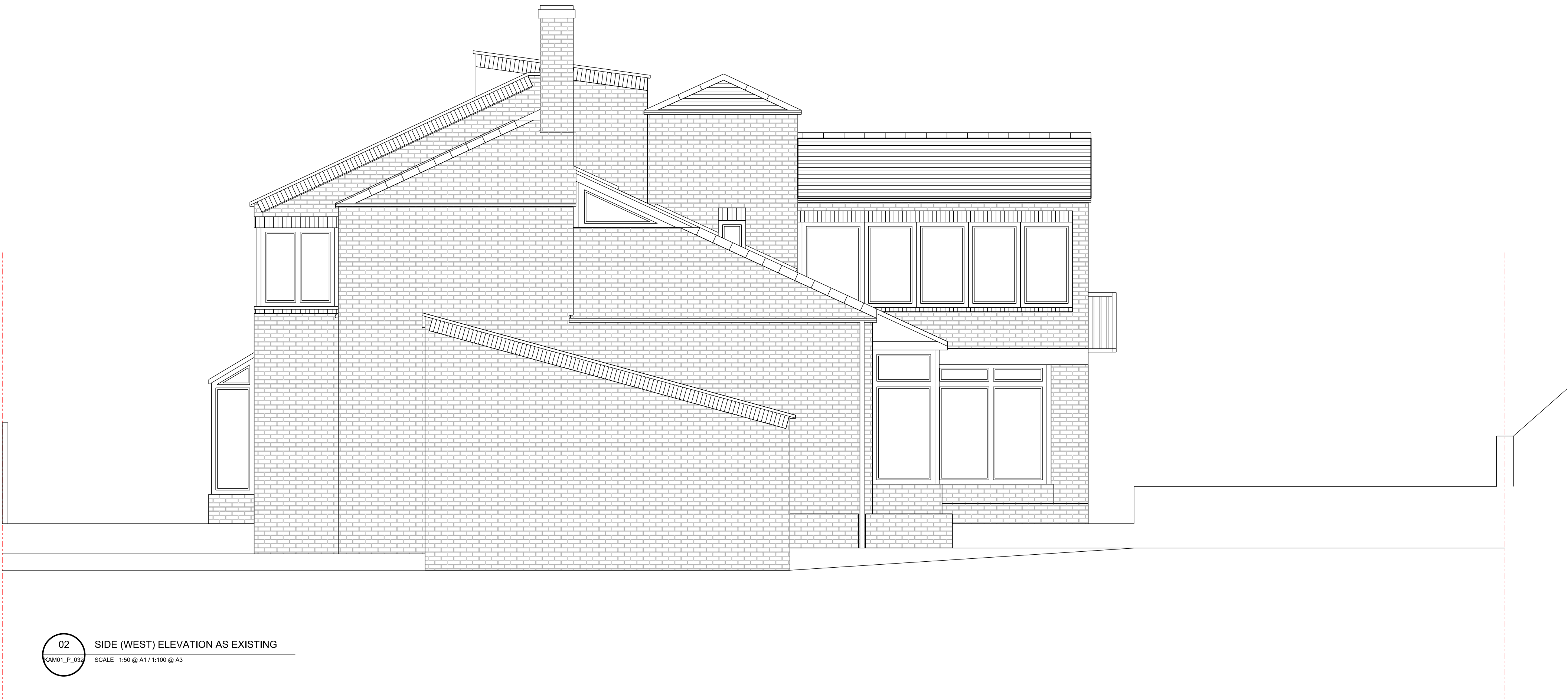
02 SIDE (WEST) ELEVATION AS EXISTING KAM01_P_032 SCALE 1:50 @ A1 / 1:100 @ A3

General Notes: Should any discrepancies be noted, please inform this office. This drawing is copyright of Matthew Allchurch Architects Limited