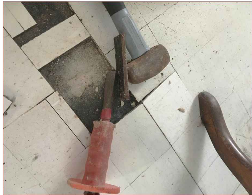
Image of the structure of the Existing flooring