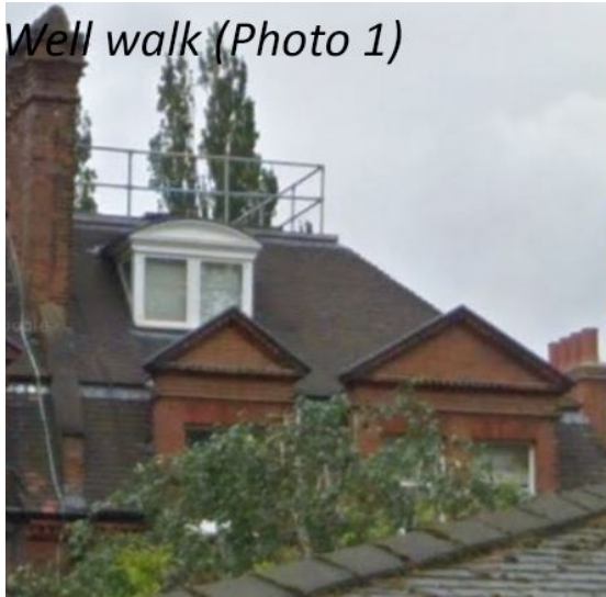
Well walk (Photo 1)