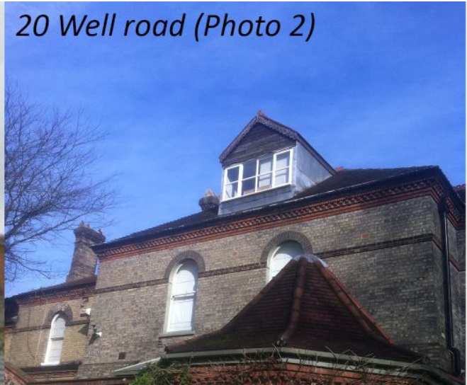
20 Well road (Photo 2)