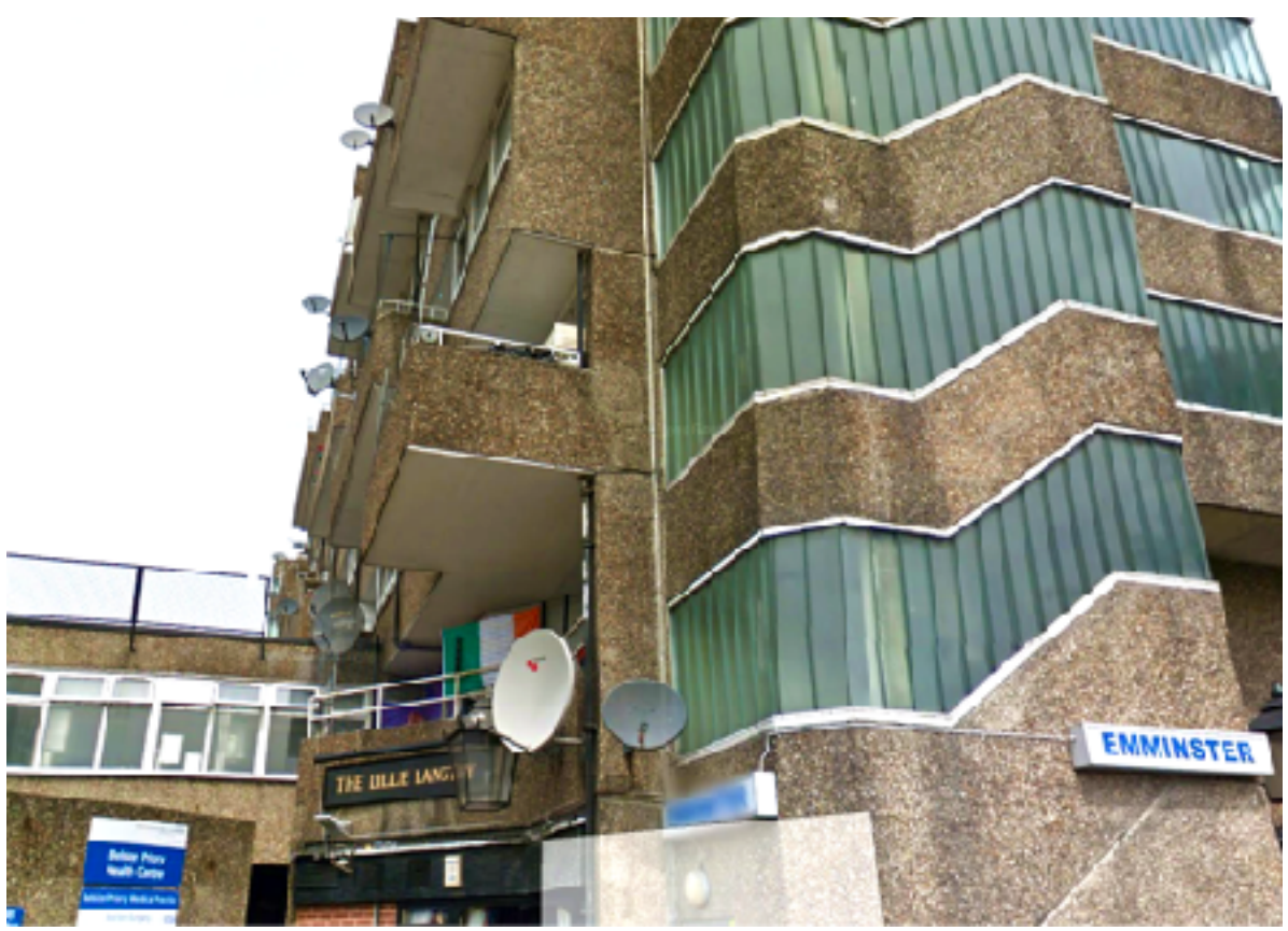
This is a view of the west facing elevation of Emminster House