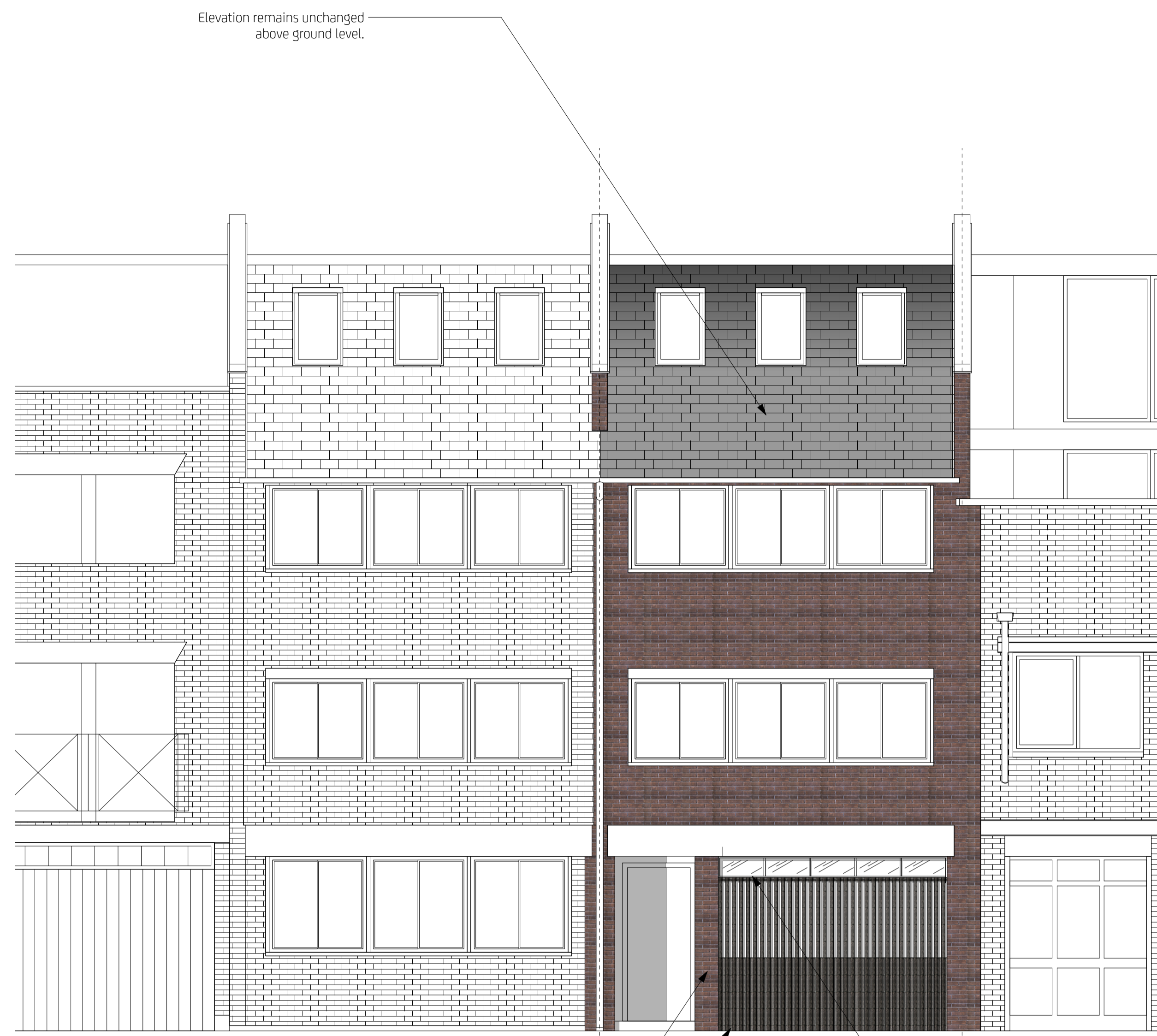
GE01 Proposed Front Elevation Scale 1:50@A1, 1:100@A3

Elevation remains unchanged above ground level. Brick to match existing. Elevation sensitive to street character and rhythm. Timber slats used and inset to compliment garage frontages along street. Gaps between timber slats at higher level allow light and outlook whilst maintaining privacy. High level windows above timber screen allow light and are reflective of street character.