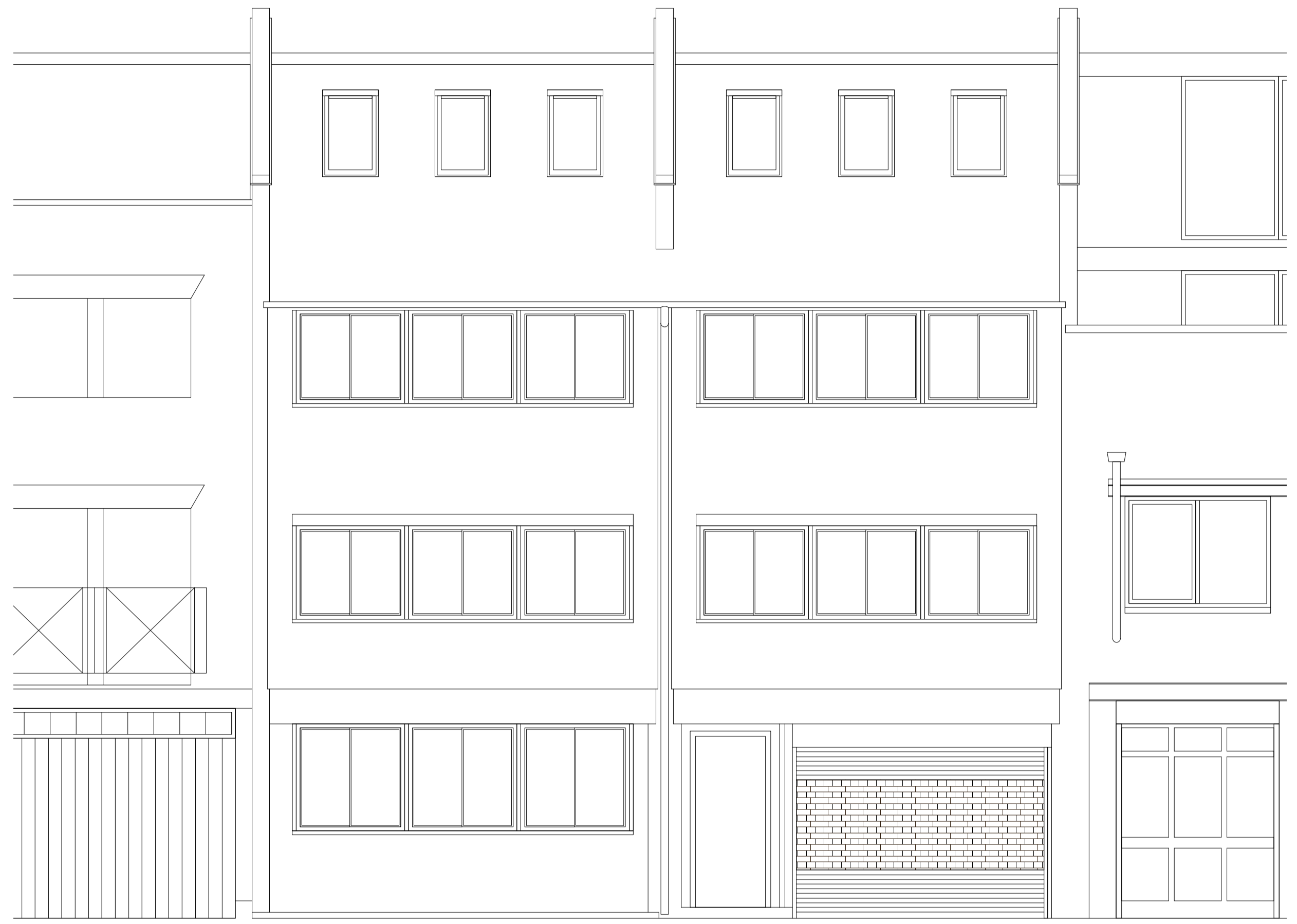
EX01 Existing Front Elevation Scale 1:50@A1, 1:100@A3