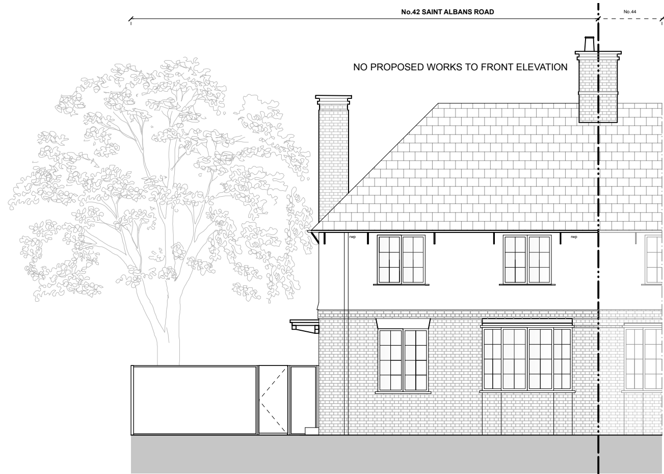
1 GA Proposed Front Elevation Scale: 1:100

PROPOSED TIMBER FRAMED WINDOWS & DOORS TO MATCH EXISTING