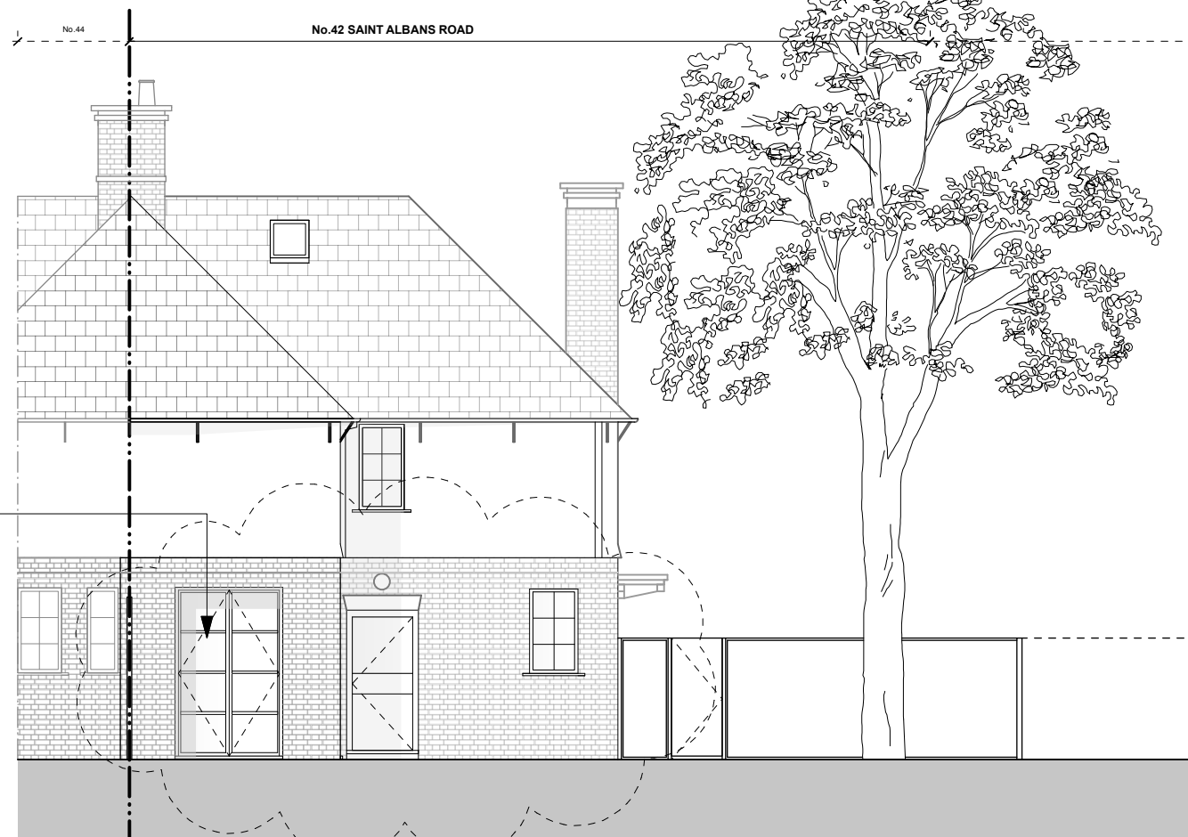
2 GA Proposed Rear Elevation Scale: 1:100