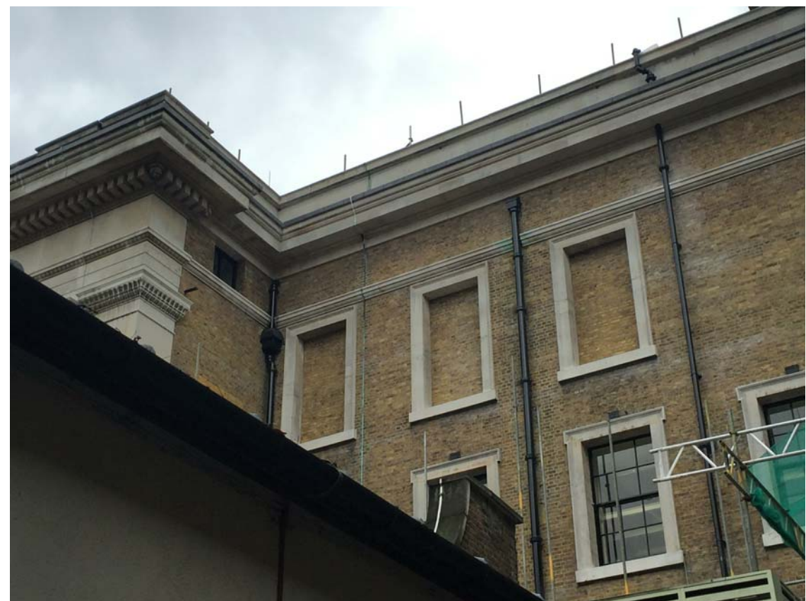
VIEW FROM EAST ROAD

Project ISLAMIC WORLD GALLERIES Prepared For The Trustees of the British Museum