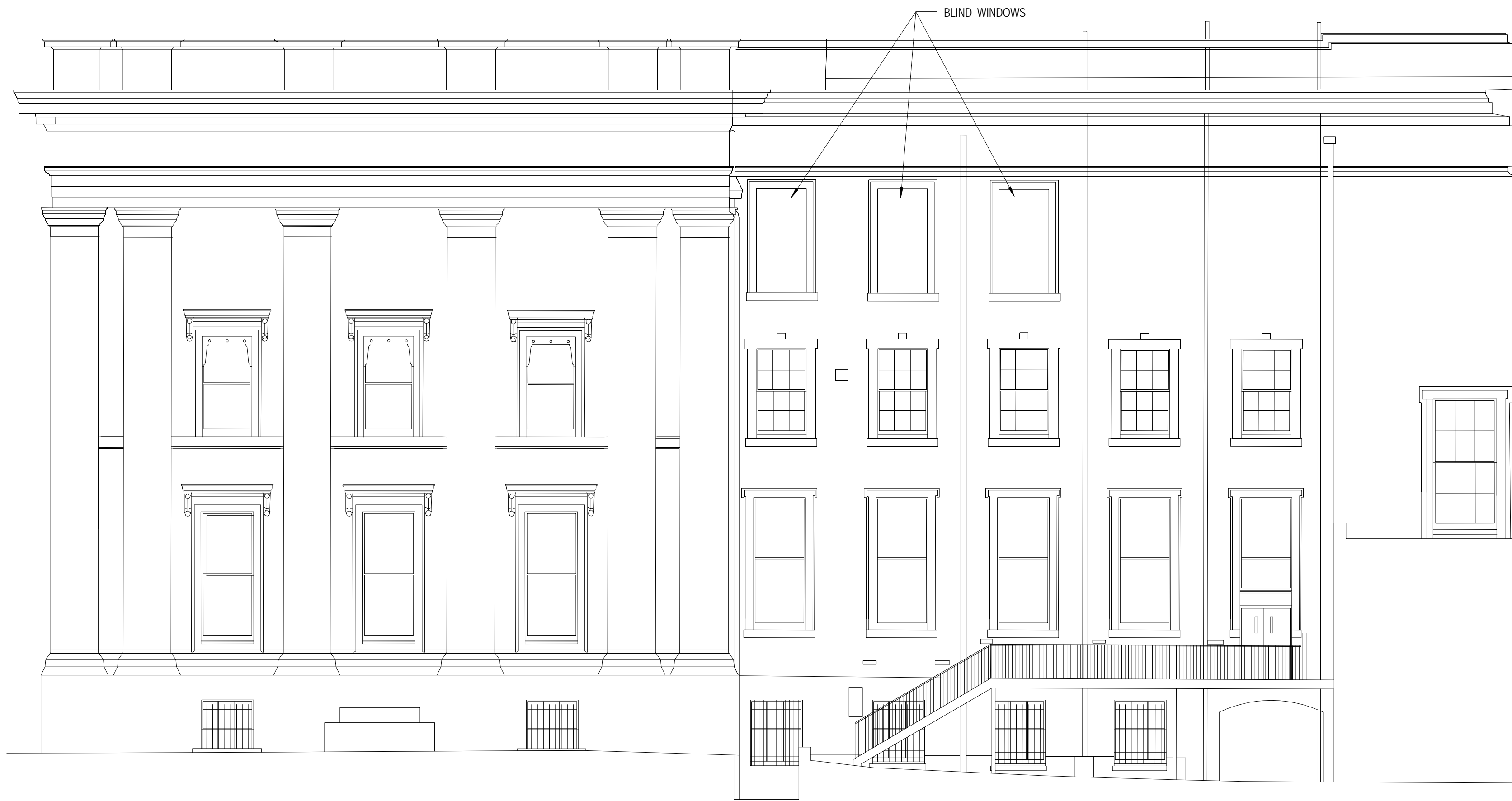
1 EXISTING EXTERNAL NORTH ELEVATION SCALE: 1 : 100