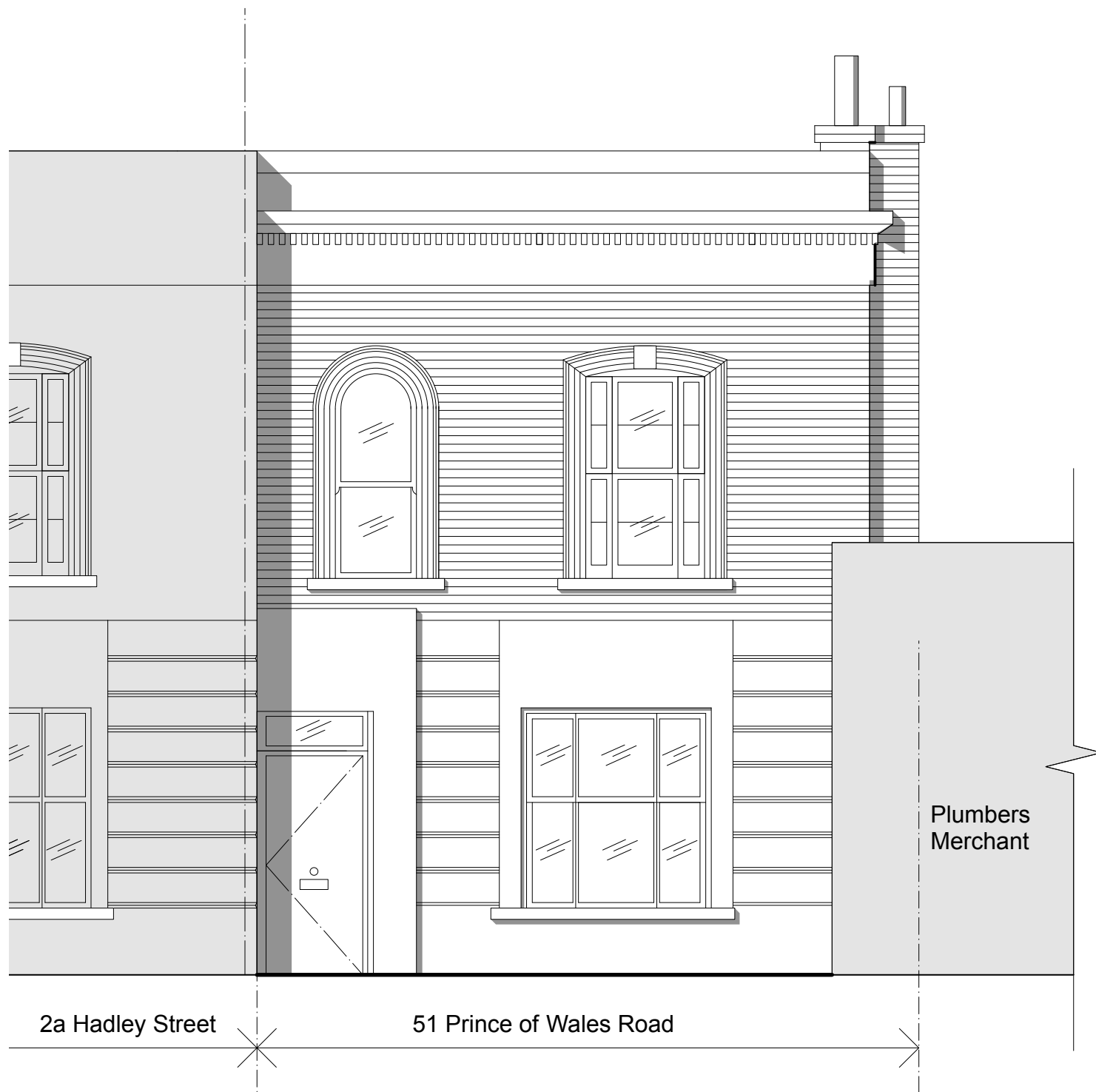
Prince of Wales Road Elevation