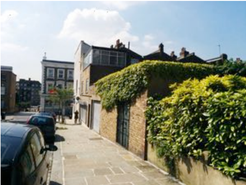
PH3 - Rear & side view of no. 71 Falkland Road from Montpelier Grove.