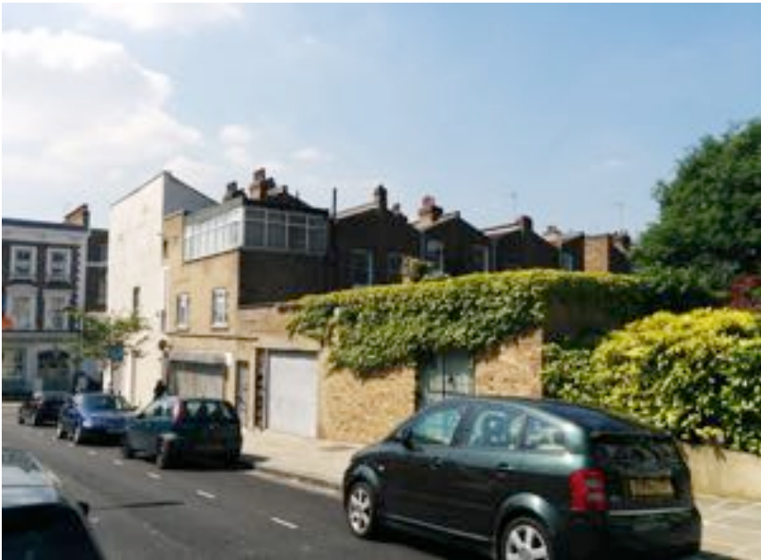
PH1 - View of no. 71 Falkland Road from Montpelier Grove.