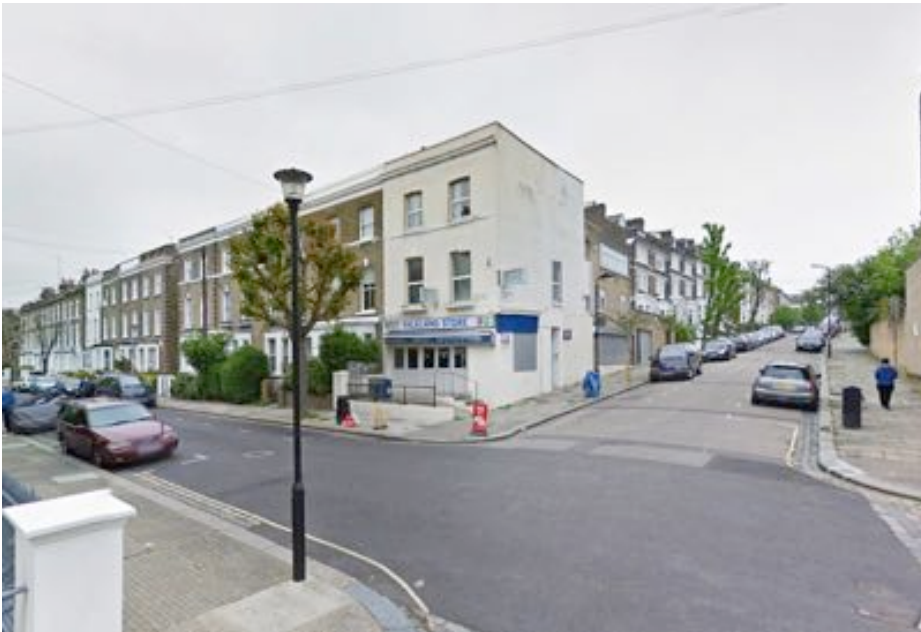
PH2 - Front and side view of no. 71 Falkland Road.