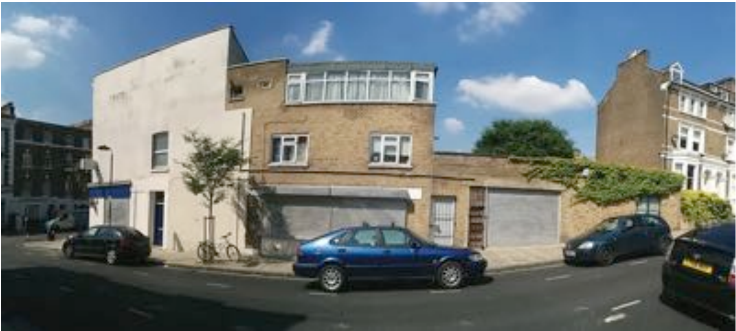
PH4 - Panoramic view of no. 71 Falkland Road from Montpelier Grove.