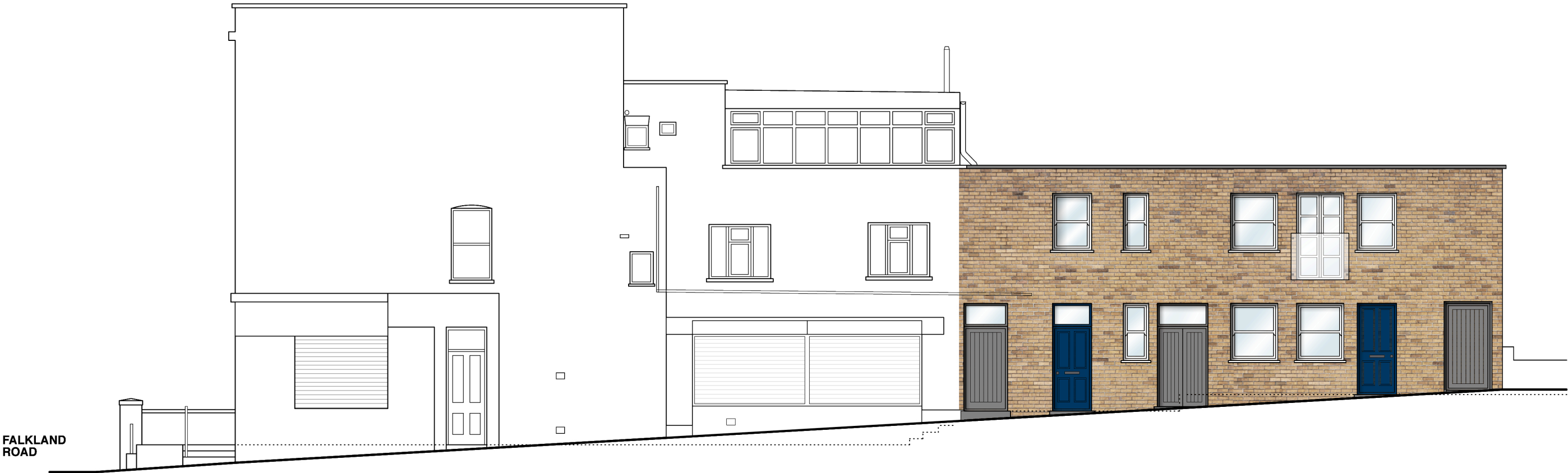
PROPOSED SIDE ELEVATION FROM MONTPELIER GROVE SHOWING MATERIALS scale 1:100