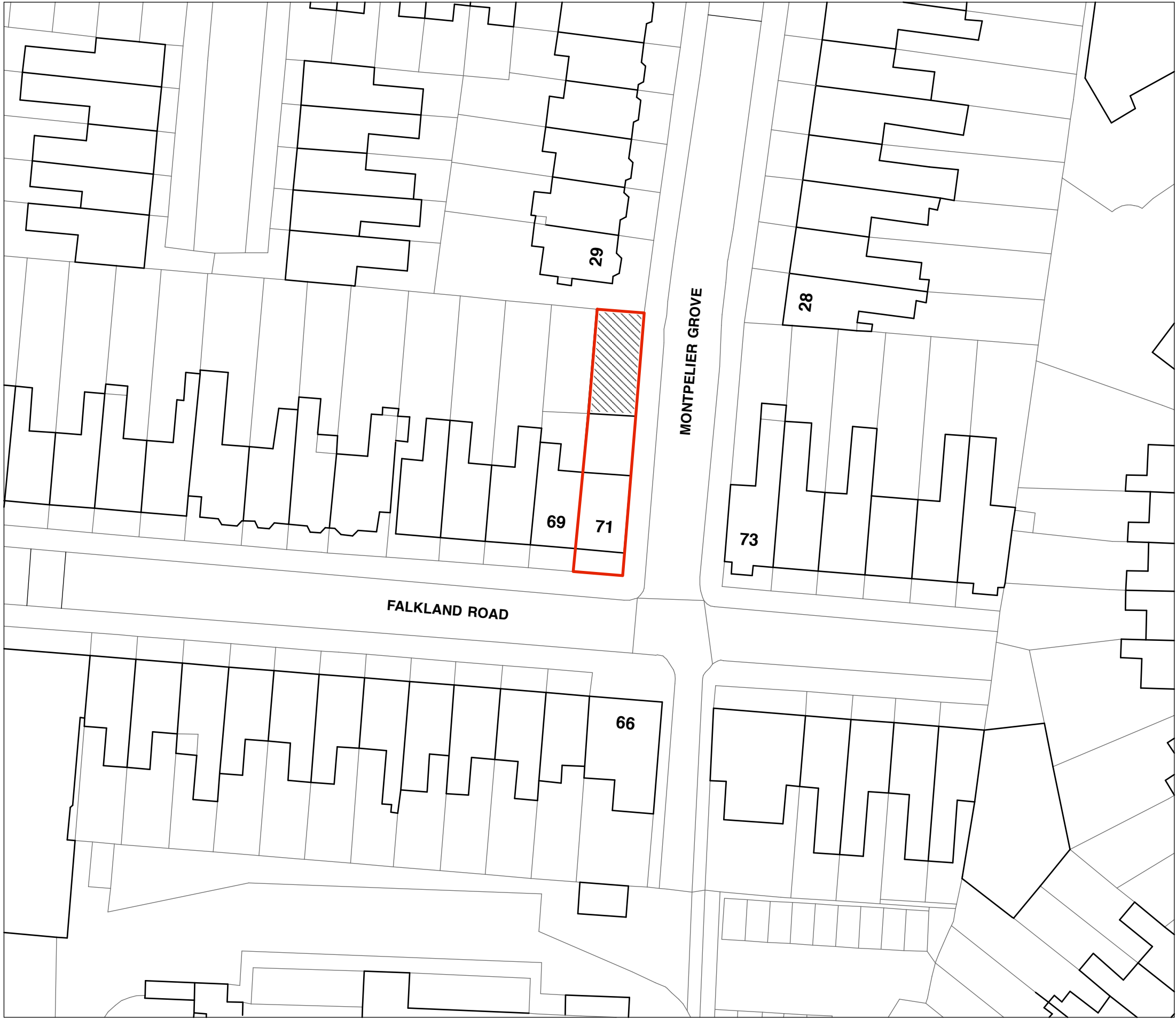
PROPOSED SITE PLAN scale 1:500