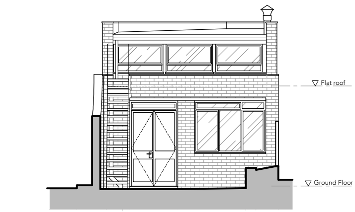
3 EXISTING REAR ELEVATION / ART STUDIO scale 1:100