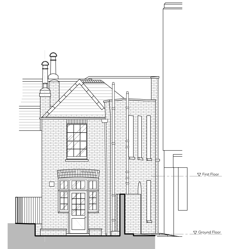
4 EXISTING REAR ELEVATION scale 1:100