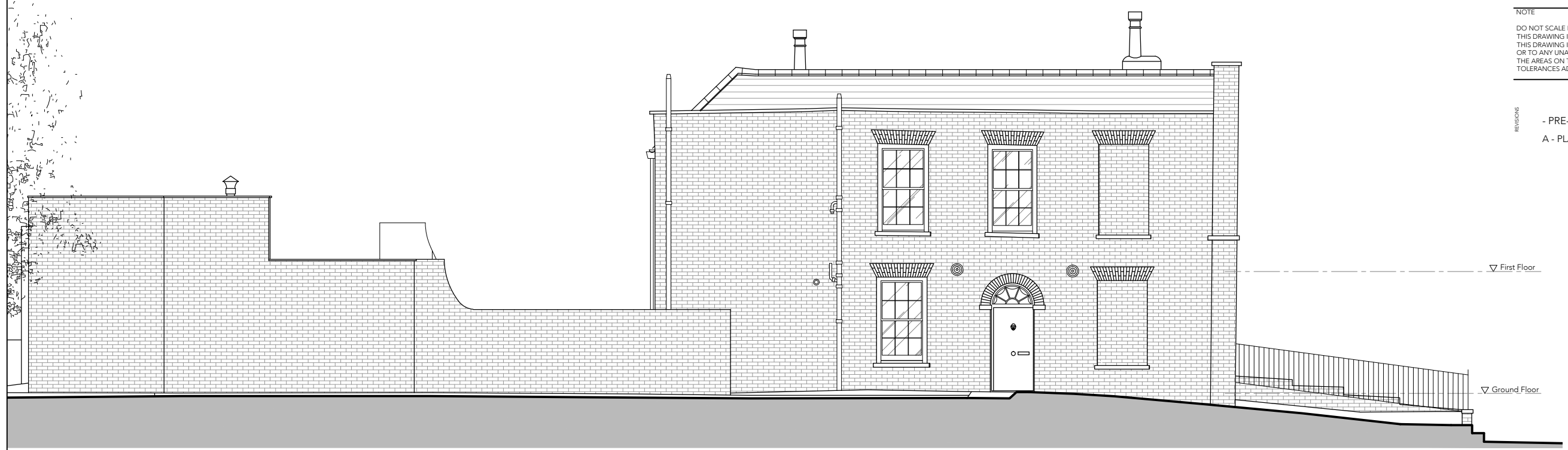
1 EXISTING SOUTH-WEST ELEVATION scale 1:100

REVISIONS - PRE-PLANNING SUBMISSION DATE 26.08.2016 A - PLANNING SUBMISSION 24.02.2017