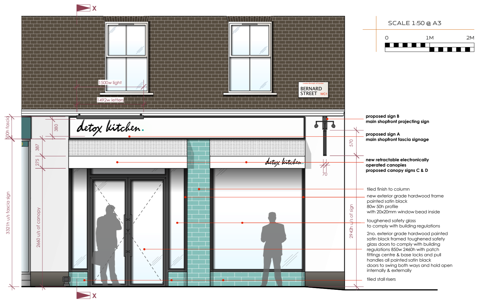
proposed SHOPFRONT ELEVATION AA WITH CANOPY OPEN