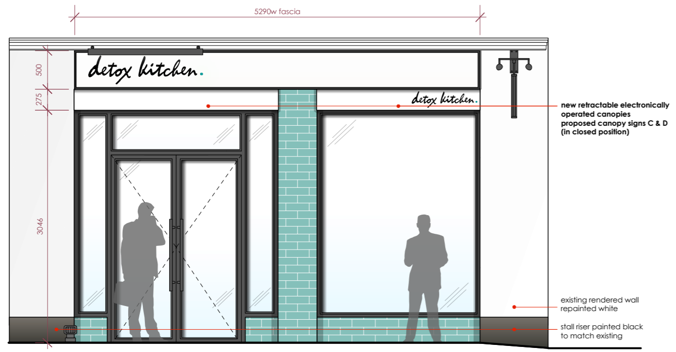
proposed SHOPFRONT ELEVATION AA WITH CANOPY CLOSED