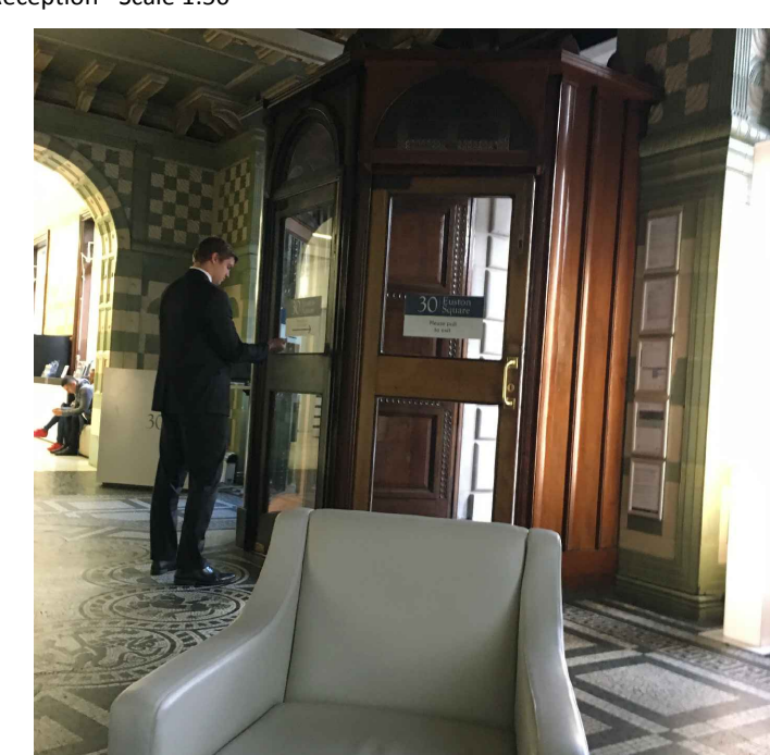
View 01 - Existing Main Entrance Lobby