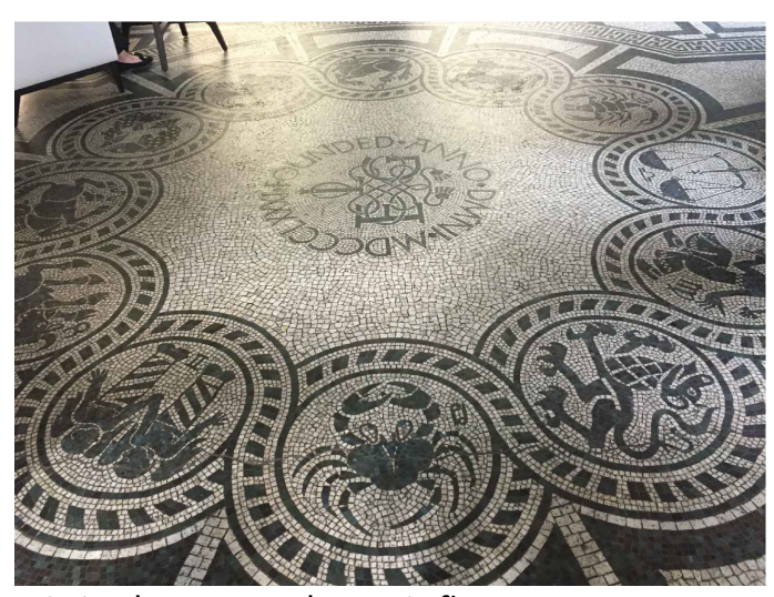
Existing 'Astronomy' Mosaic floor