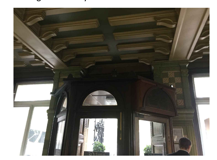
View 01 - Existing Main Entrance Lobby