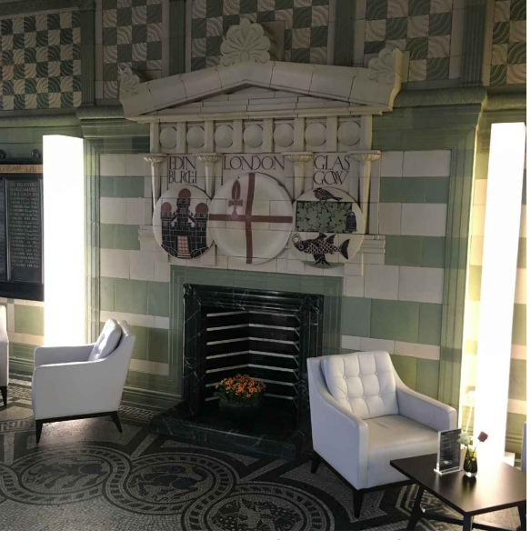
View 03 - Existing Fireplace Detail