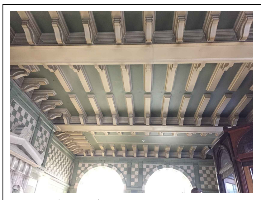
Existing Ceiling Detail