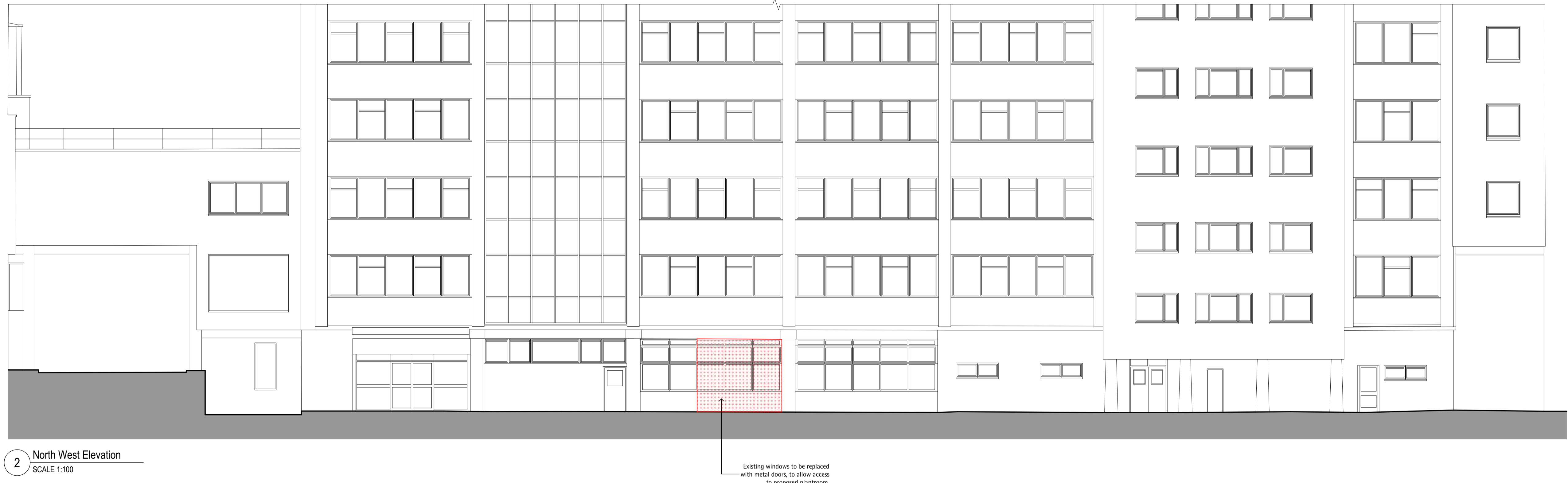
2 North West Elevation SCALE 1:100