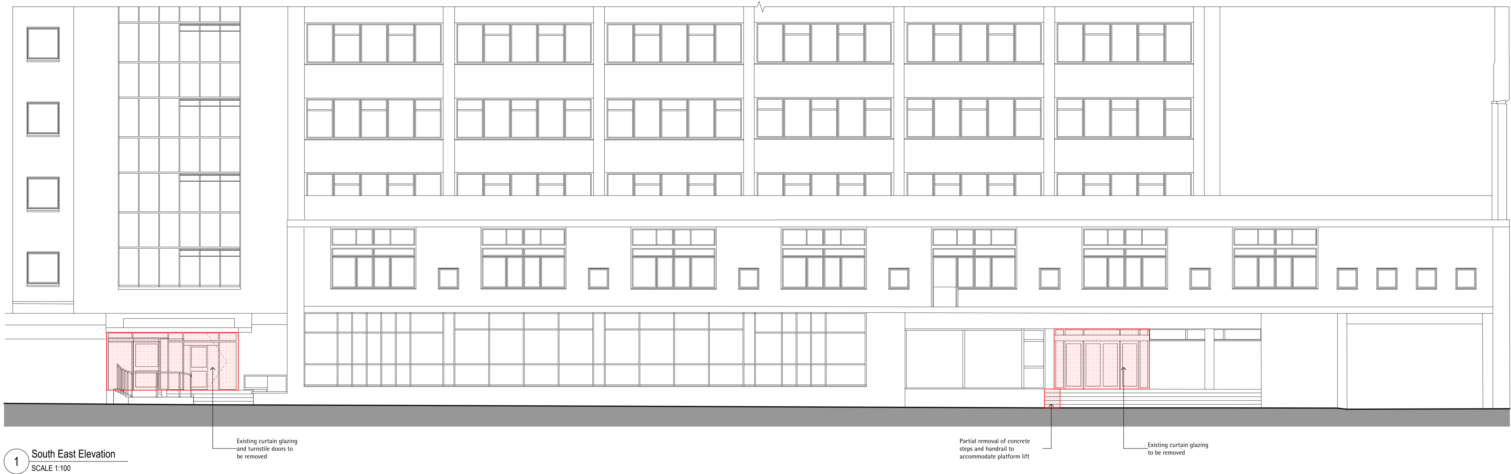
1 South East Elevation SCALE 1:100