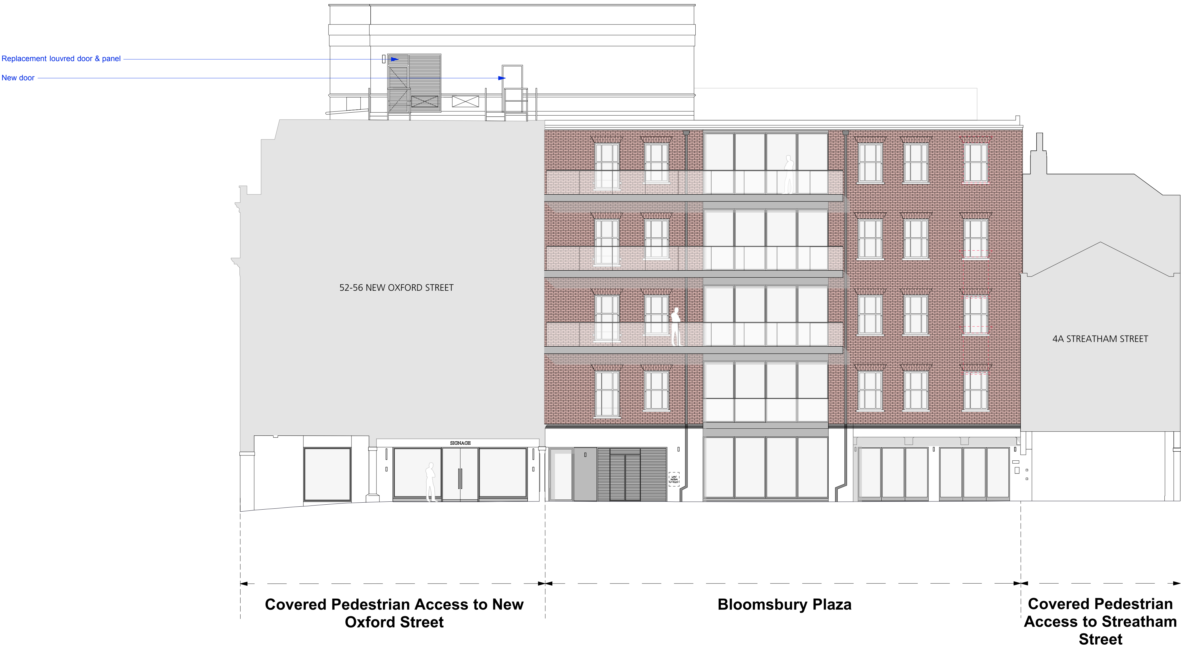
1 Proposed East Elevation 1:100 at A1