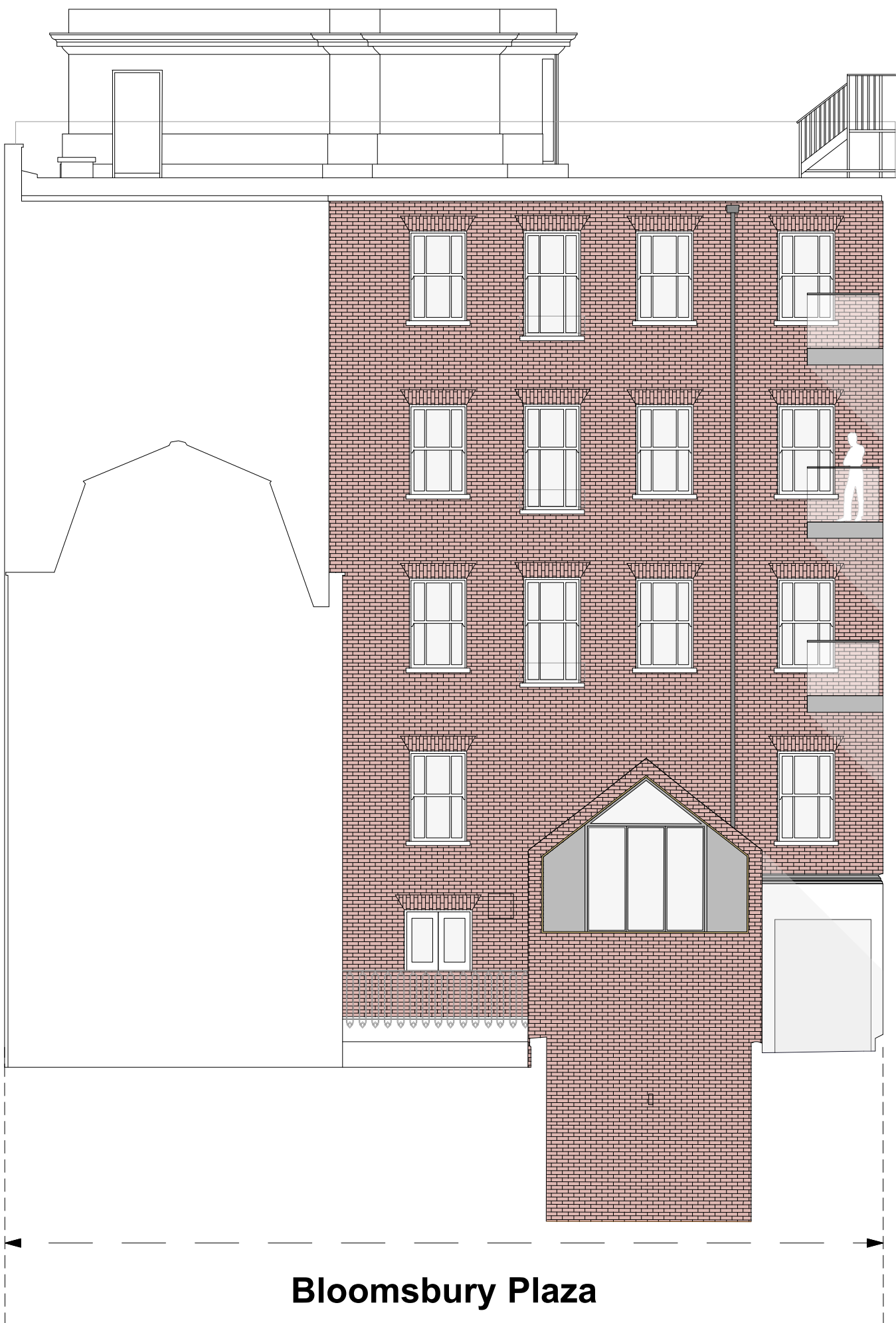
2 Proposed Courtyard North Elevation 1:100 at A1