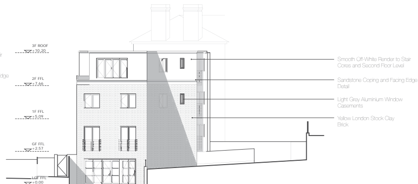
Elevation 02 EAST ELEVATION