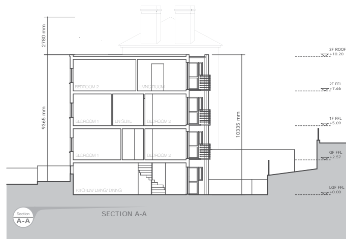
Section A-A SECTION A-A

Project 7659_Burghley Court Ingestre Road London NW5 1UF