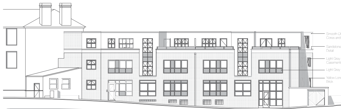
Elevation 01 FRONT ELEVATION INGESTRE ROAD