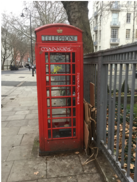
2016/6053/P UoL Senate House, Malet Street.