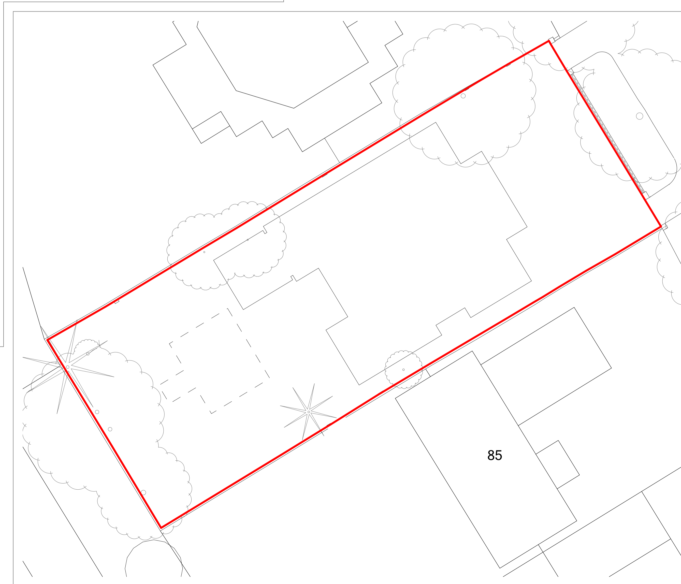
Site Block Plan 1:200

Adjacent Properties and Boundaries are shown for illustrative purposes only and have not been surveyed unless otherwise stated. All areas shown are approximate and should be verified before forming the basis of a decision. Do not scale other than for Planning Application purposes. All dimensions must be checked by the contractor before commencing work on site. No deviation from this drawing will be permitted without the prior written consent of the Architect. The copyright of this drawing remains with the Architect and may not be reproduced in any form without prior written consent. Ground Floor Slabs, Foundations, Sub-Structures, etc. All work below ground level is shown provisionally. Inspection of ground condition is essential prior to work commencing. Reassessment is essential when the ground conditions are apparent, and redesign may be necessary in the light of soil conditions found. The responsibility for establishing the soil and sub-soil conditions rests with the contractor.