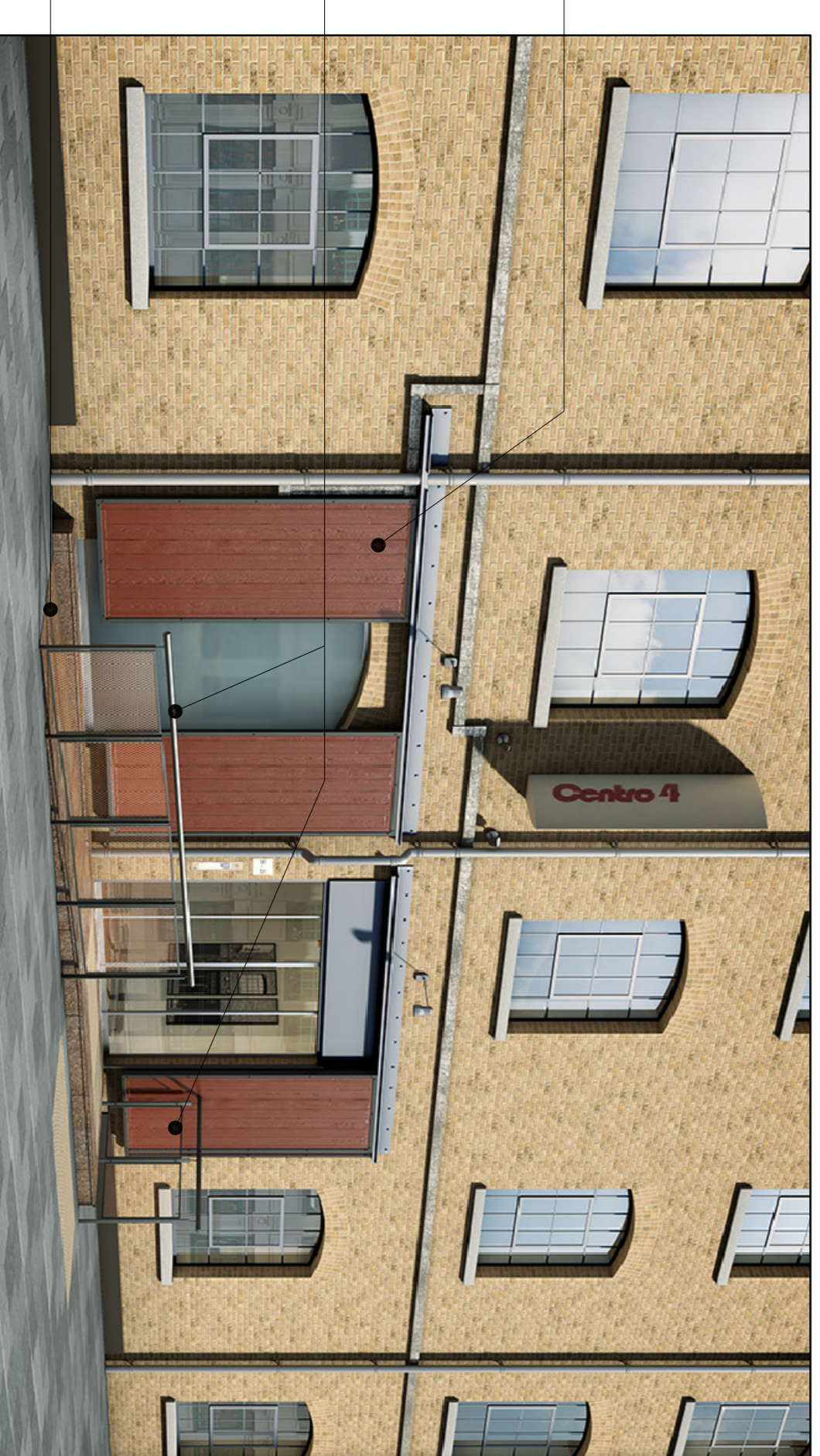
PROPOSED SCALE 1:100@A1

This drawing is protected under Copyright and at no time must any portion of this drawing be reproduced or copied in anyway without the permission of Morgan Lovell. All dimensions must be checked on site and NOT scaled from this drawing.