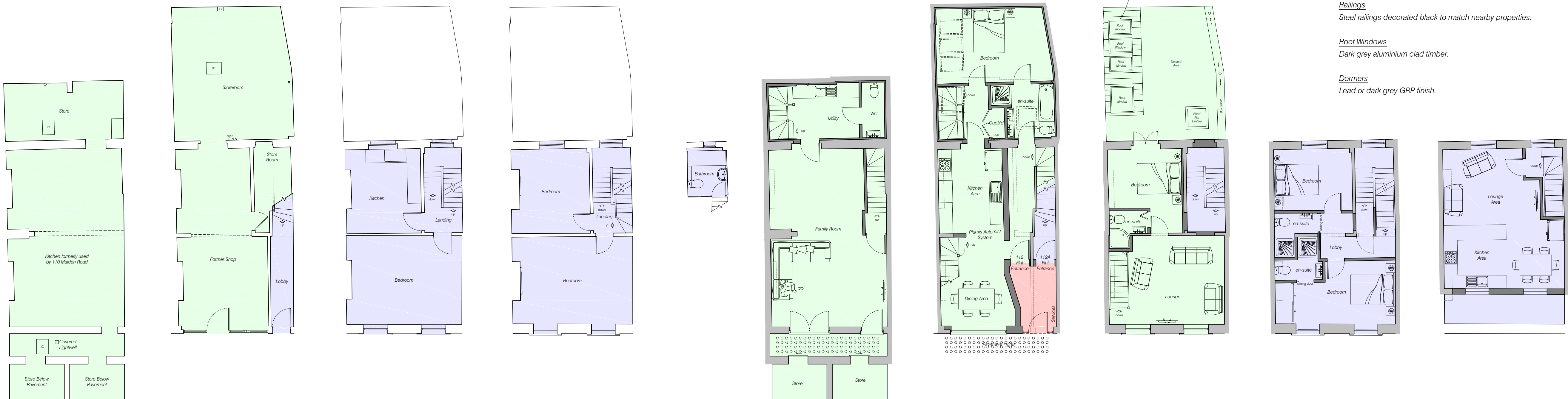
Existing Basement Plan Scale 1:100