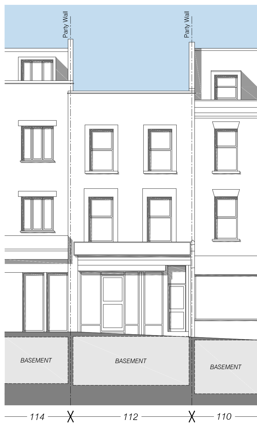
Principle Elevation (West) Viewed from Malden Road