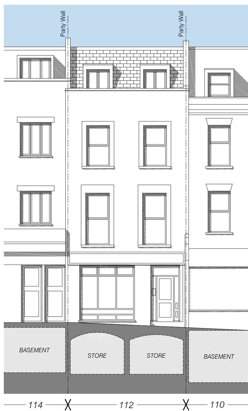
Principle Elevation (West) Viewed from Malden Road