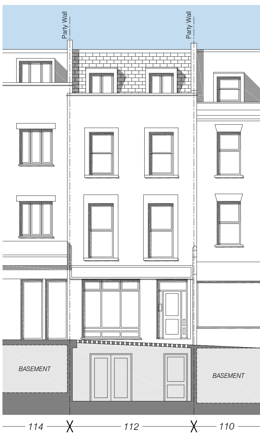
Principle Elevation & Part Section (West) Viewed from Malden Road