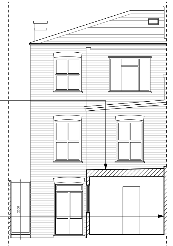
B-B Section B-B

Existing party wall no alteration needed