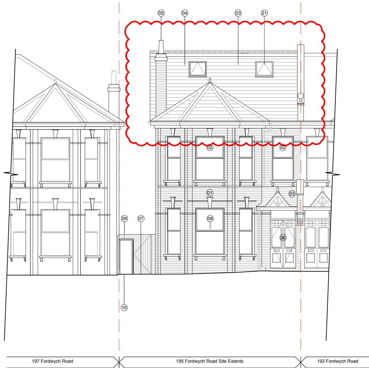
01 PROPOSED SOUTH WEST (FRONT) ELEVATION SCALE AT 1:100