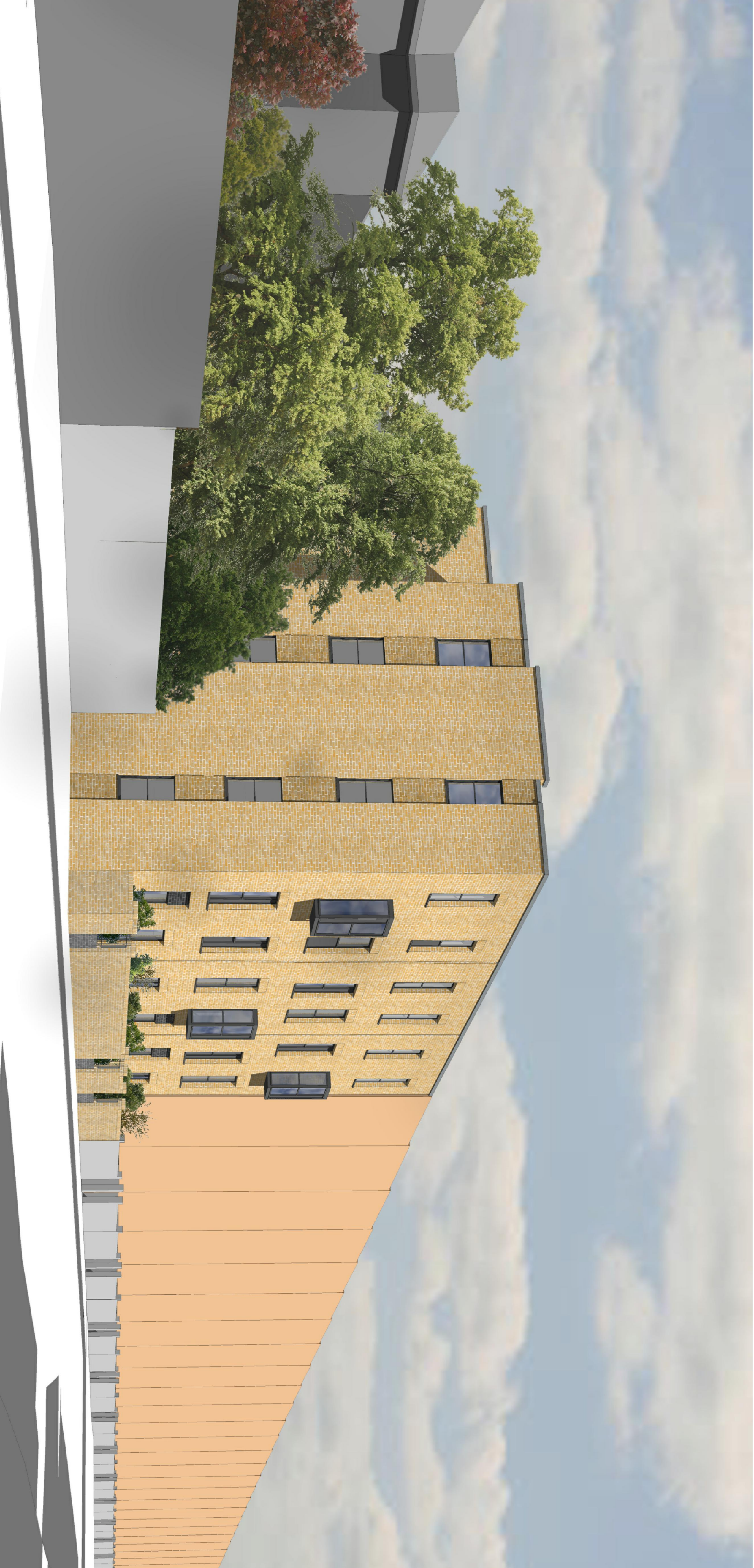
Proposed visual from York Way Viewed towards the North

The contractor must check all dimensions, levels and services prior to commencement of any work. Box Architects to be notified of any discrepancy. Do not scale from drawings. All work must be checked and approved by Box Architects. All drawings are the property of Box Architects and shall remain the property of Box Architects. The drawing remains the copyright of Box Architects. To be used solely for the project and not for resale.