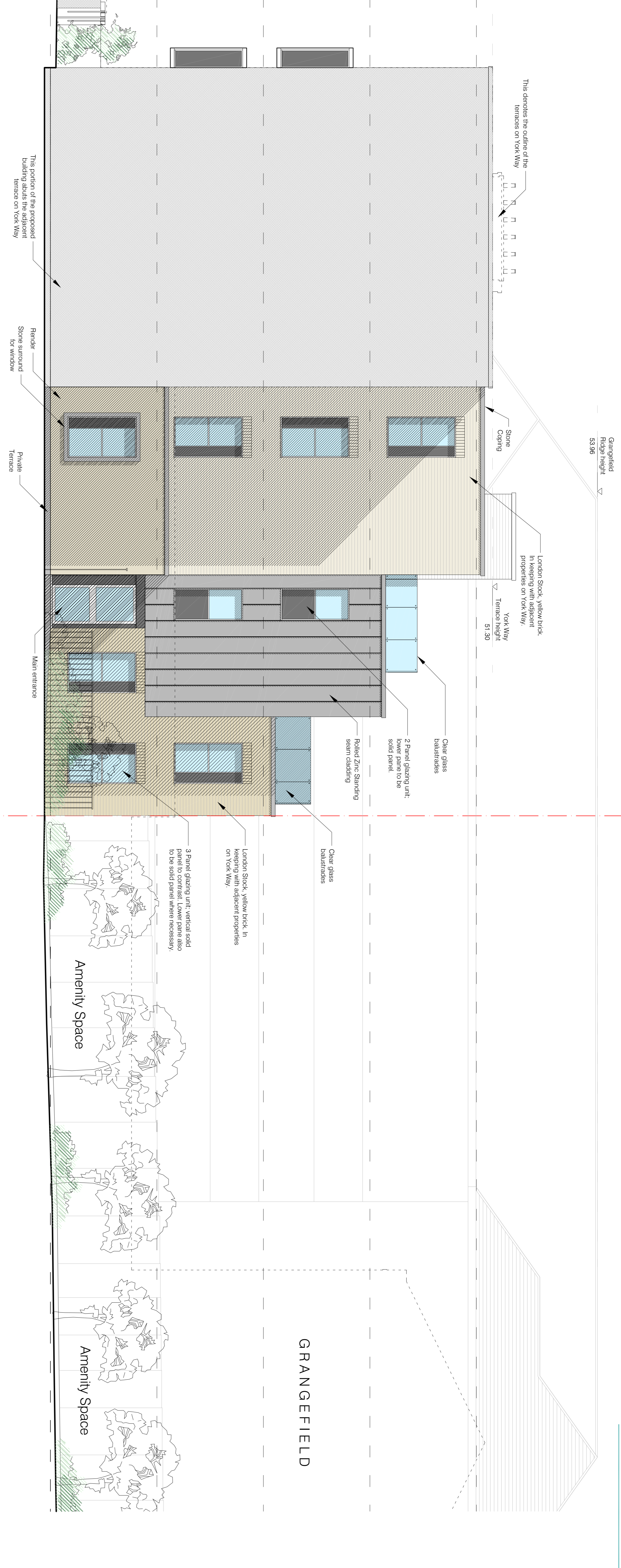
Elevation A (North Facing) Scale 1:50

The contractor must check all dimensions, levels and services prior to commencement of any work. Box Architects to be notified of any discrepancy. Do not scale from drawings. Any work by Box Architects to be notified of any discrepancy. Do not scale from drawings. This drawing must not be copied without prior written permission. The drawing remains the copyright of Box Architects. All rights reserved. No part of this drawing may be reproduced, stored in a retrieval system, or transmitted in any form or by any means, electronic, mechanical, photocopying, recording, or by any information storage and retrieval system, without the prior written permission of Box Architects.