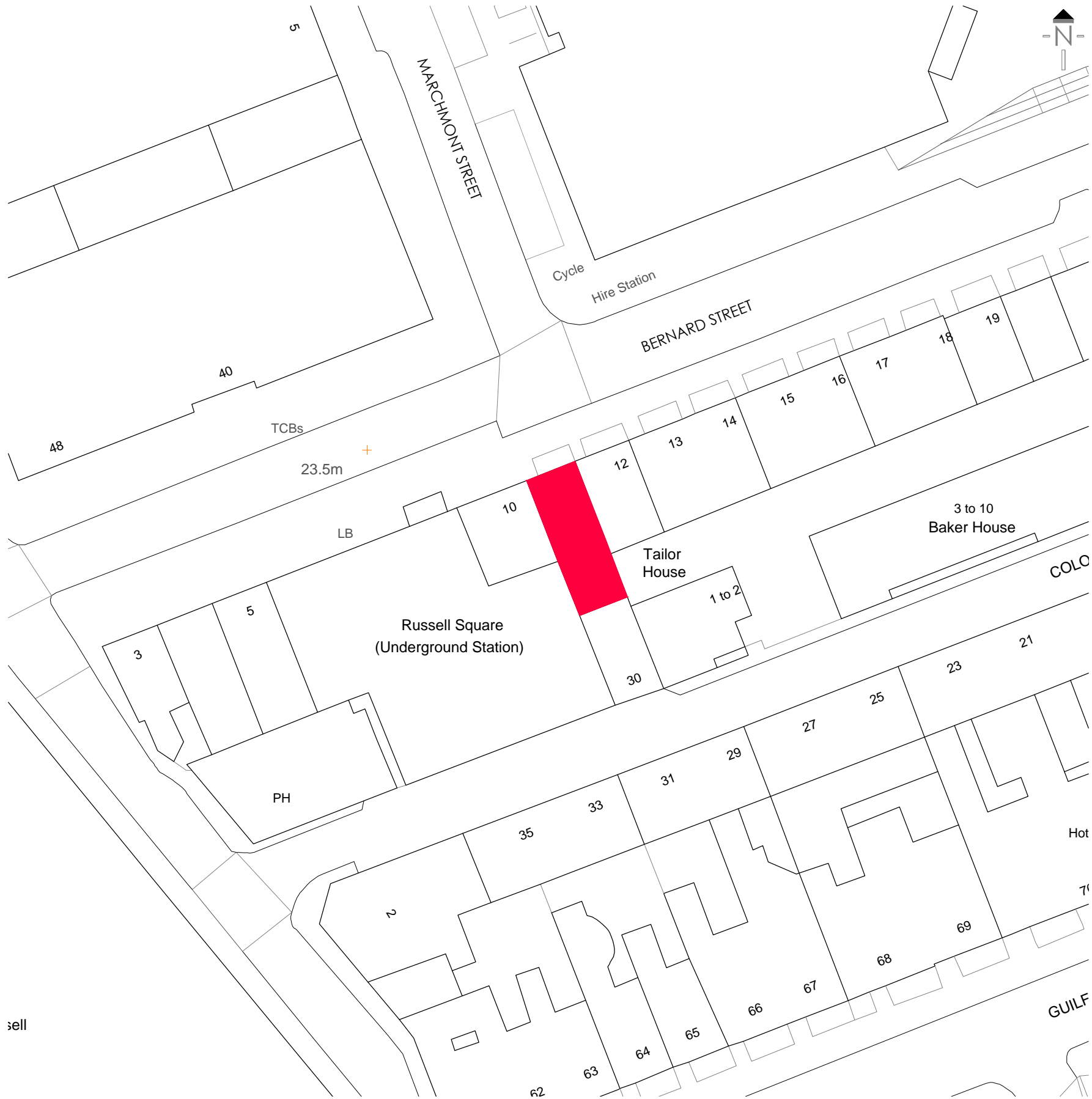
01 EXISTING SITE PLAN SCALE 1:250 @A1 1:500 @ A3