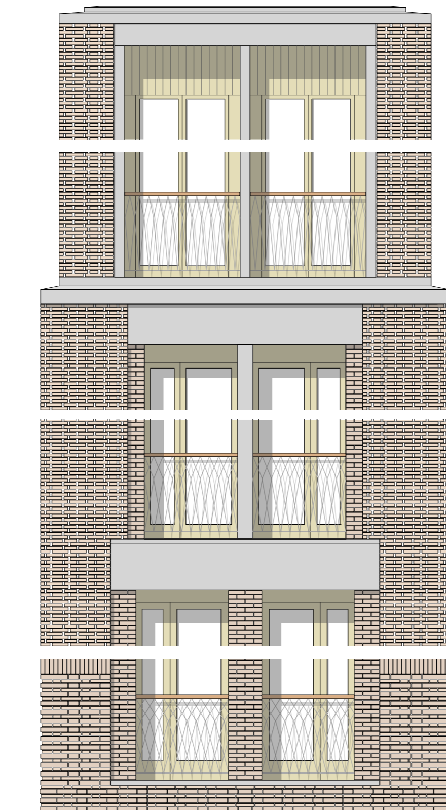
Approved planning scheme