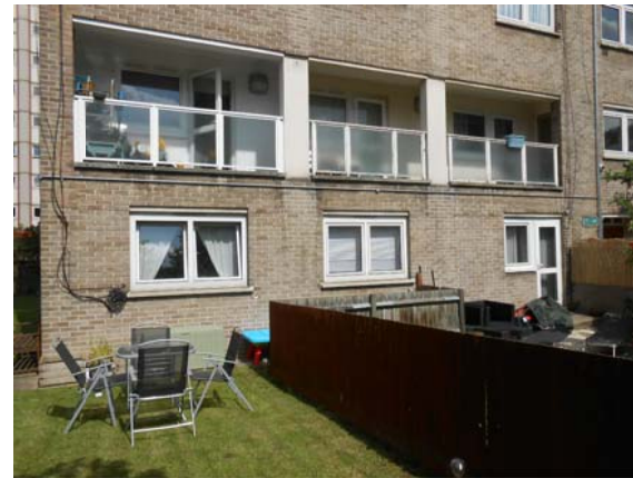
Fig. 1 Rear Elevation Photograph & view of neighbour's door to garden NTS