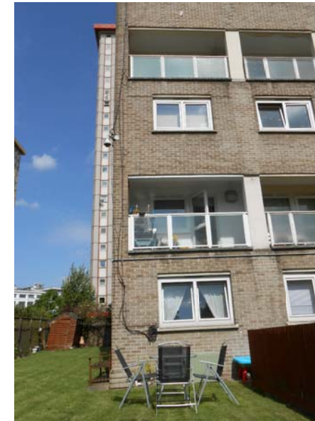
Fig. 2 Rear Elevation Photograph NTS