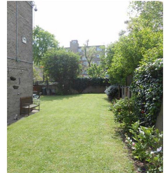
Fig. 3 Relation to rear garden view from side elevation towards the back - NTS