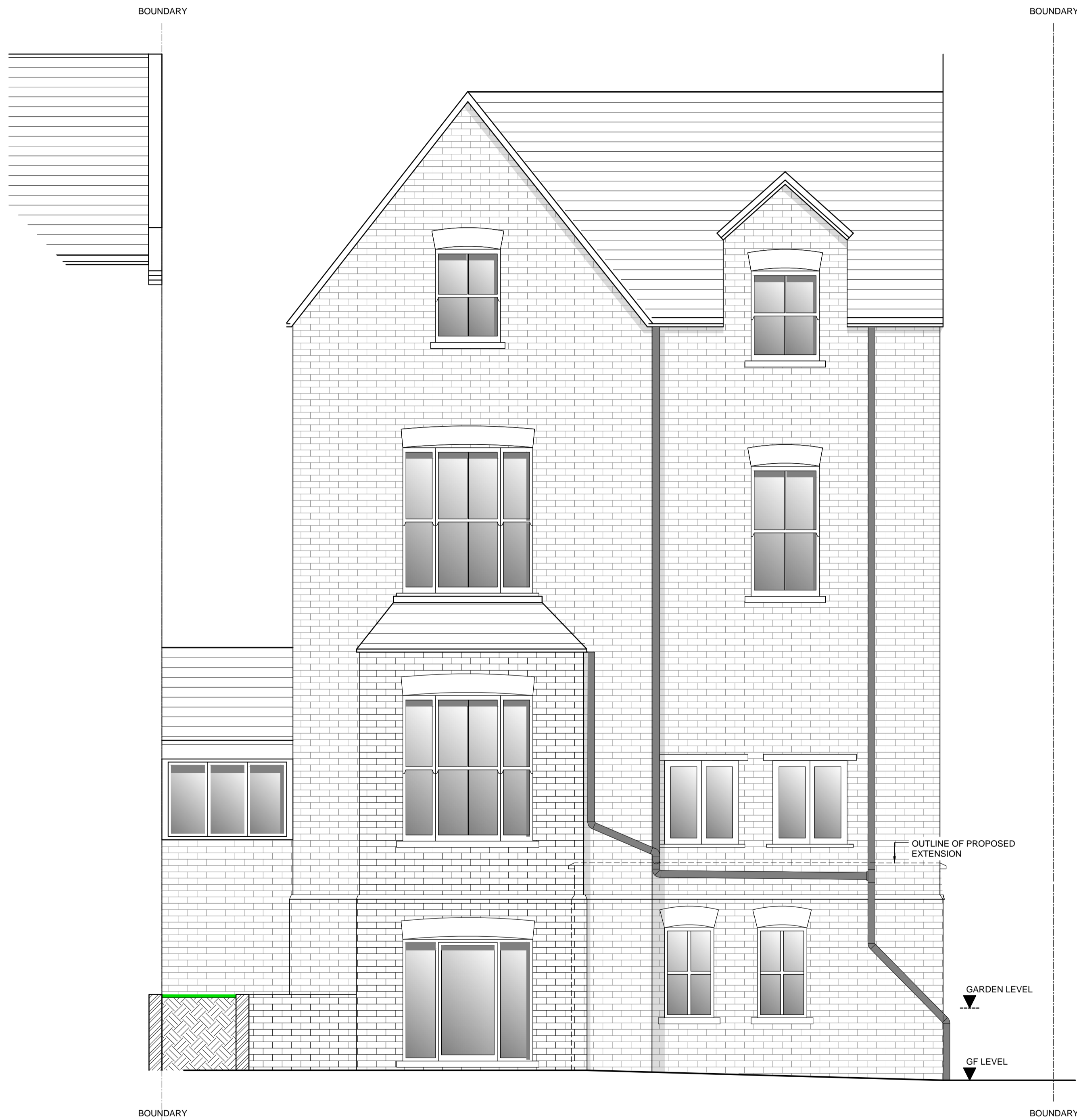
EXISTING REAR ELEVATION SCALE 1:50