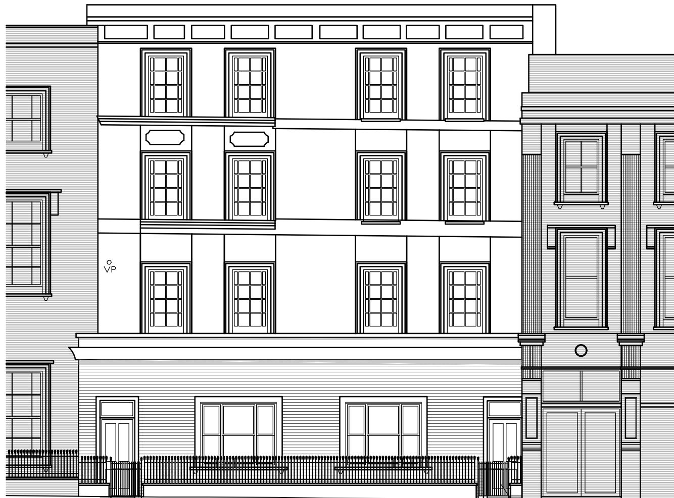
Proposed Front Elevation Showing New Railings (View from Prince of Wales Road)

Use figured dimensions only. All dimensions are to be checked on site and any discrepancies, errors or omissions are to be reported to the architect prior to commencement of works.