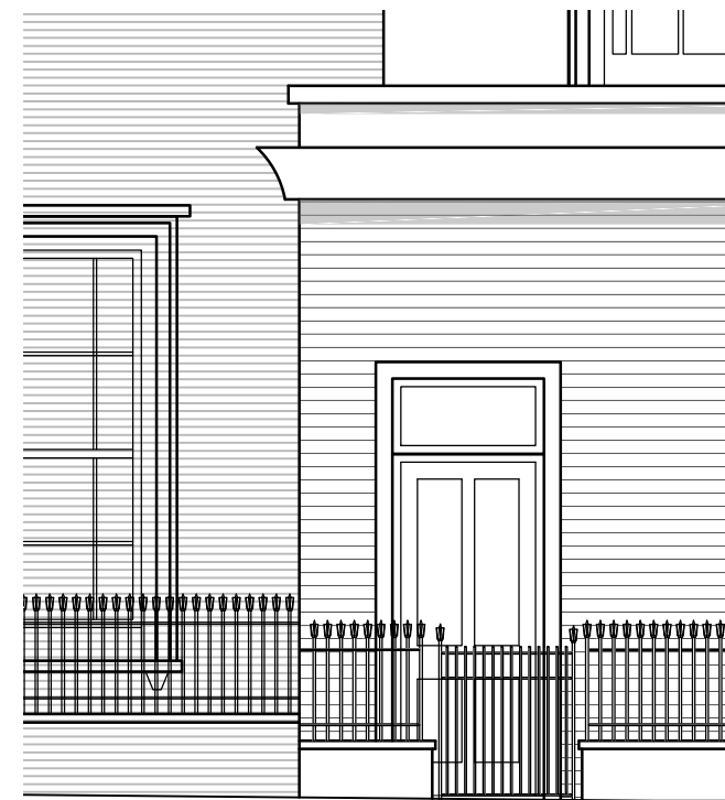
Detail view of proposed boundary wall

Note: Railing details to be approved by Local Authority prior to construction