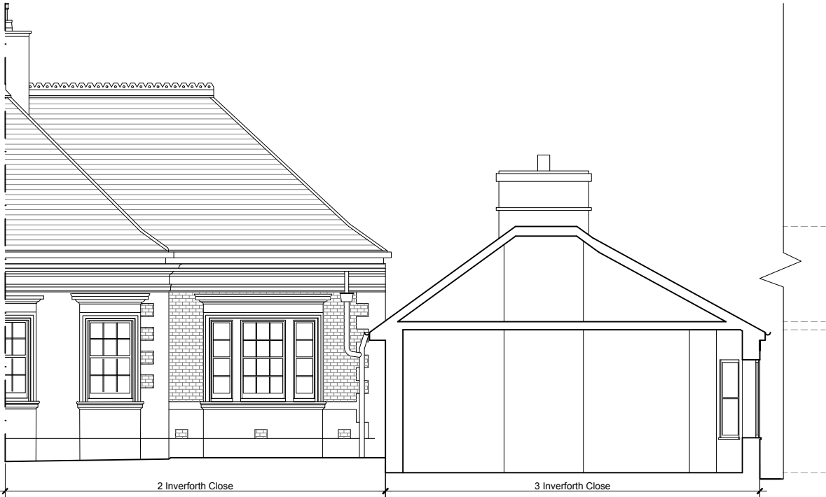
EXISTING SECTION DD