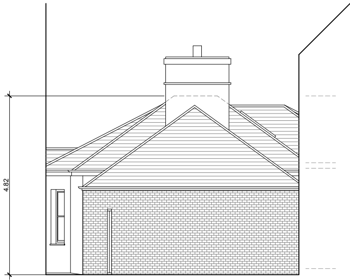
EXISTING SOUTH SIDE ELEVATION