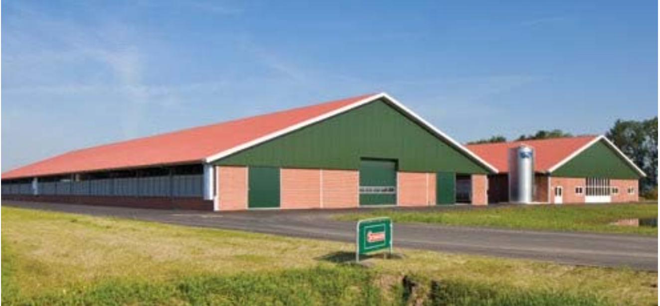
Berghorst Farm Shed, Dronten, Netherlands

Sinusoidal is a through-fix sinusoidal profiled insulated roof panel which can be used for building applications with roof pitches of 4° or more after deflection.