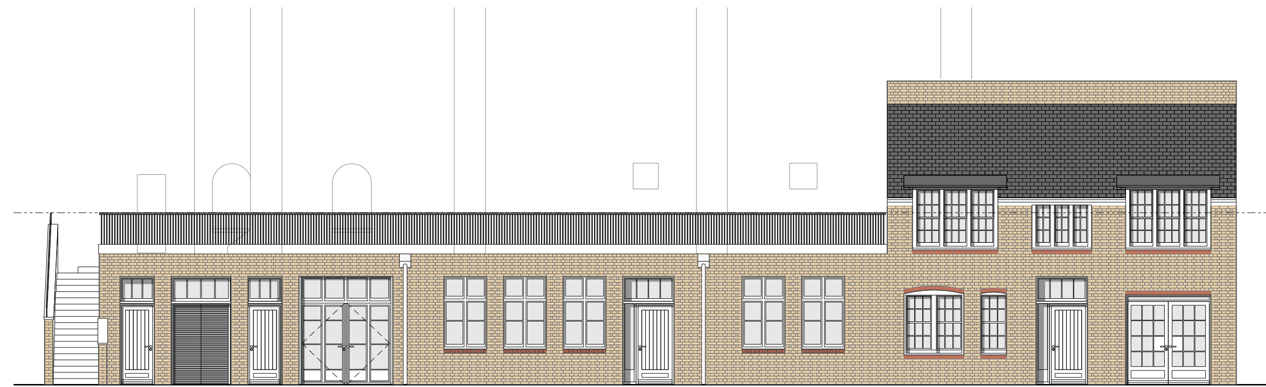
02 Flank Aldwych Elevation Y-Y 1:100