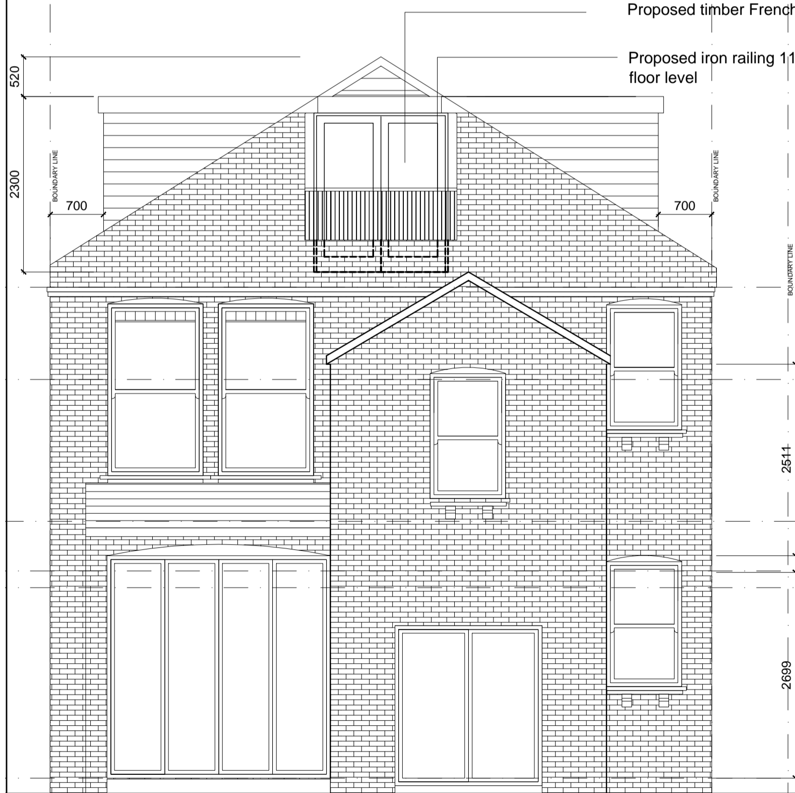
03: PROPOSED REAR ELEVATION SCALE 1:50