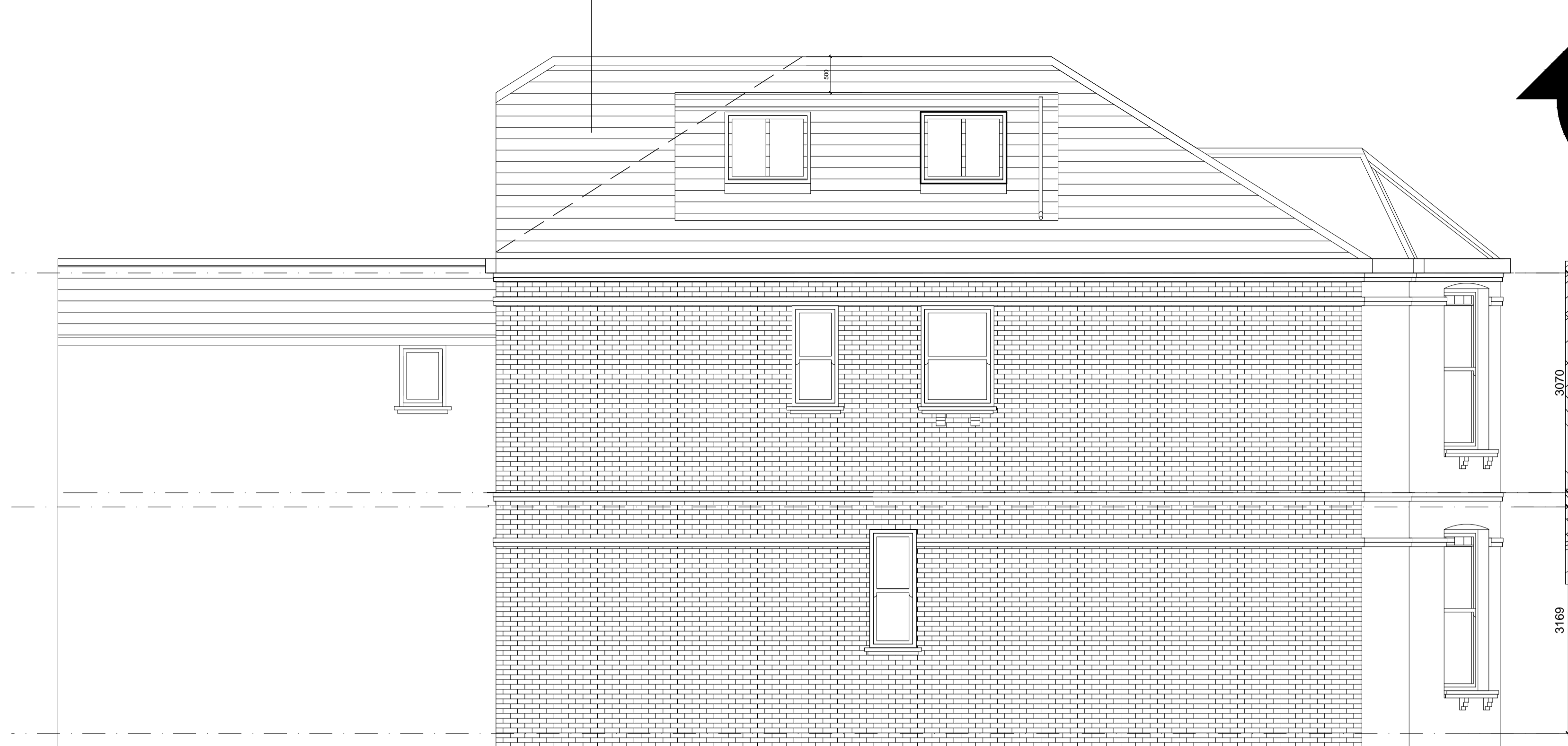
02: PROPOSED SIDE ELEVATION SCALE 1:50