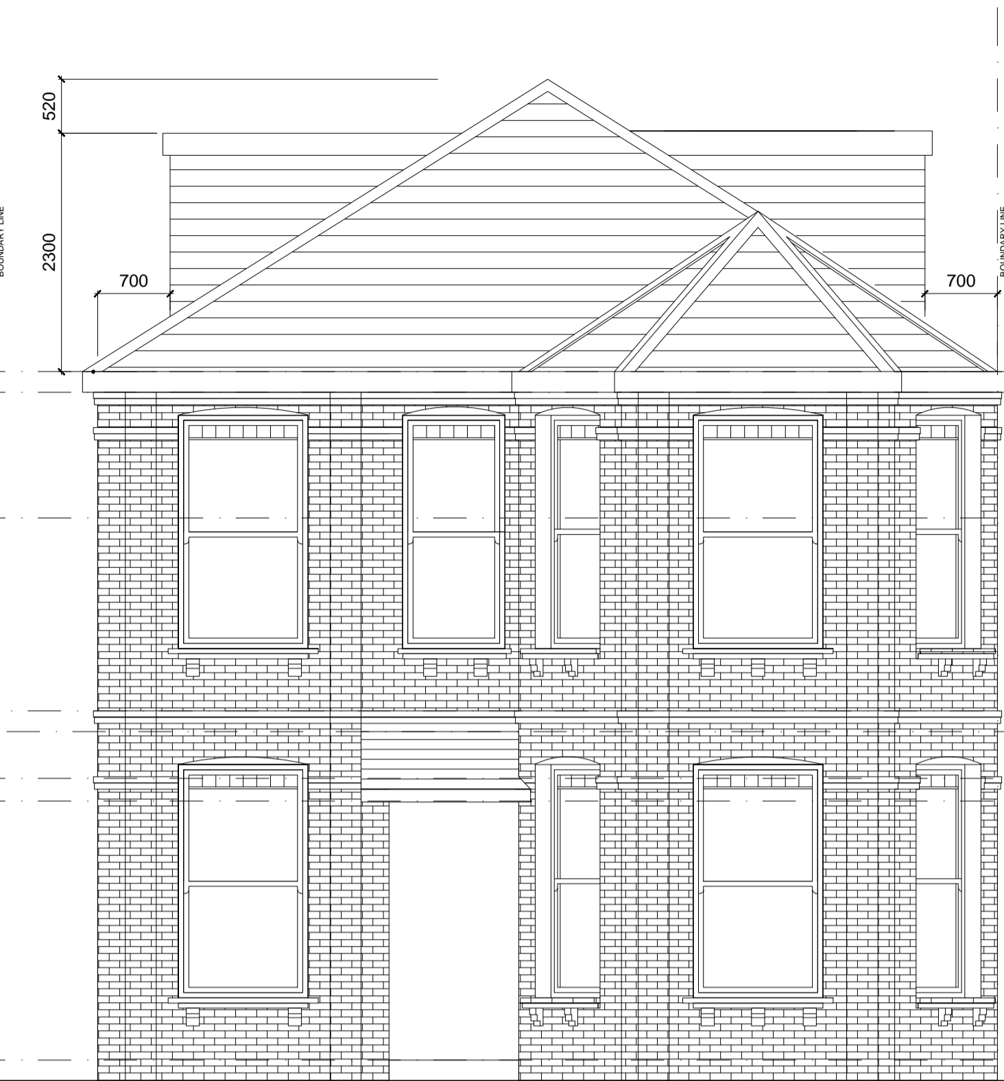
01: PROPOSED FRONT ELEVATION SCALE 1:50