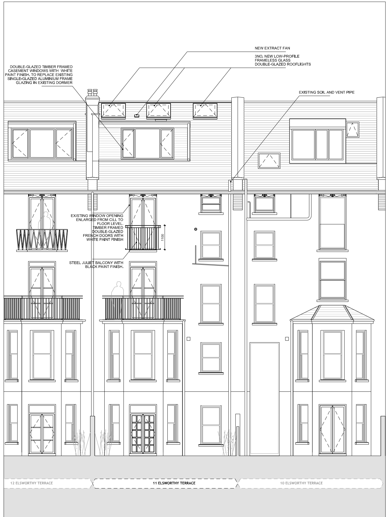
WEST ELEVATION - REAR FACADE

rossaprendergastdesign © 7 Aberdeen Mansions, Kenton Street, London, WC1N 1NL, UK T: +44 790 473 6785 E: rossa.prendergast@gmail.com