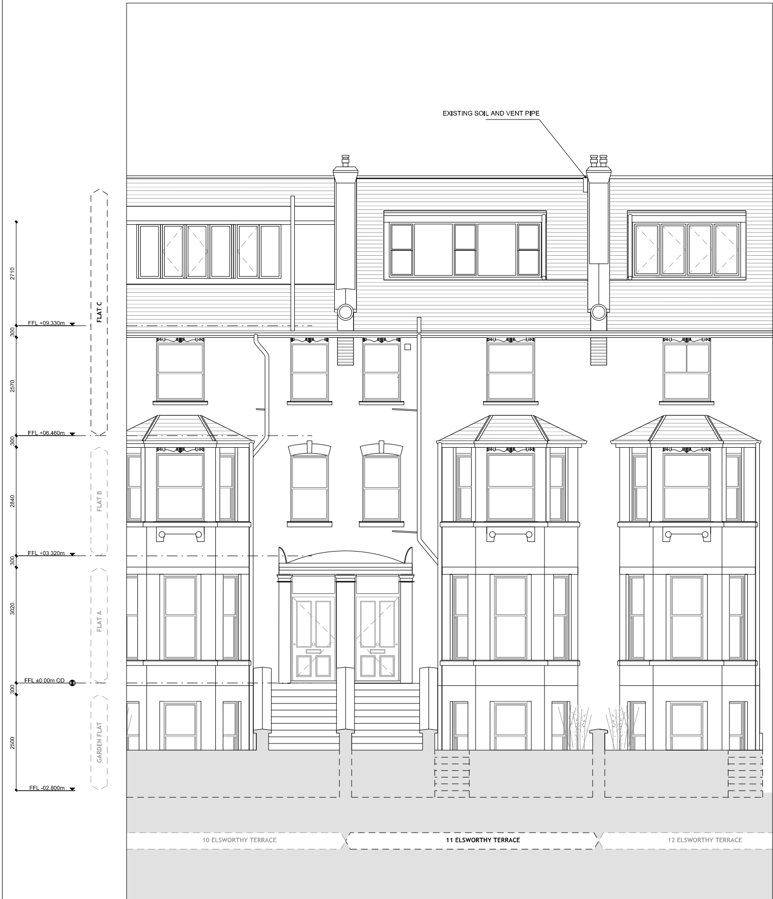
EXISTING - EAST ELEVATION - FRONT FACADE

Dimensions to be verified on site. Figured Dimensions to take precedence to those scaled. All discrepancies to be clarified with Project Architect / Designer. Unless otherwise stated all levels to be AOD. This drawing is the property of Rossa Prendergast Design and is issued on the condition that it is not reproduced, retained or disclosed to any unauthorised person, either wholly or in part, without written consent.