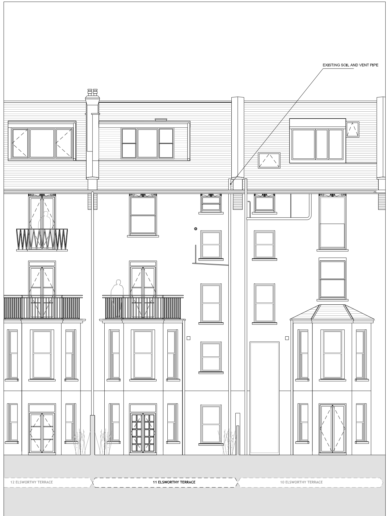
EXISTING - WEST ELEVATION - REAR FACADE